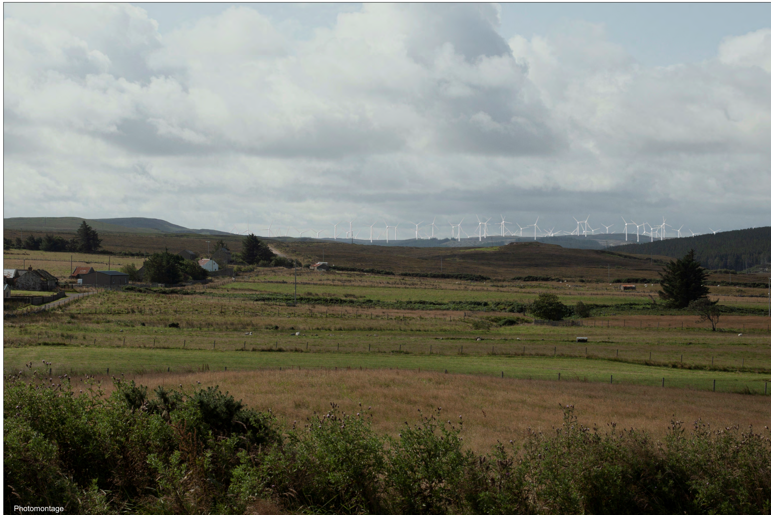
FIGURE 4.27e - VP 5: Strathy 75mm Single Frame Photomontage

This image should be viewed at a comfortable arms length (approx 500mm)