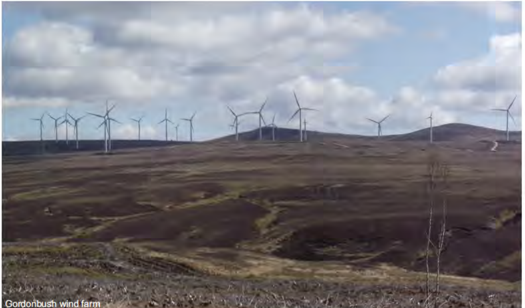
Gordonbush wind farm