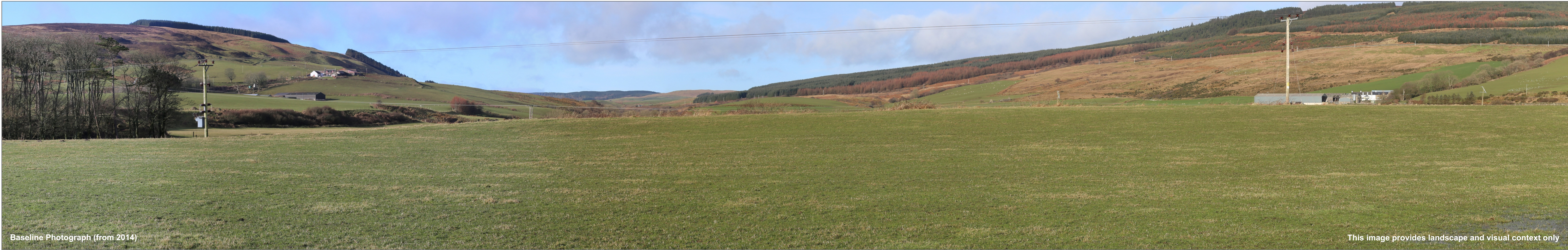
Baseline Photograph (from 2014)

This image provides landscape and visual context only