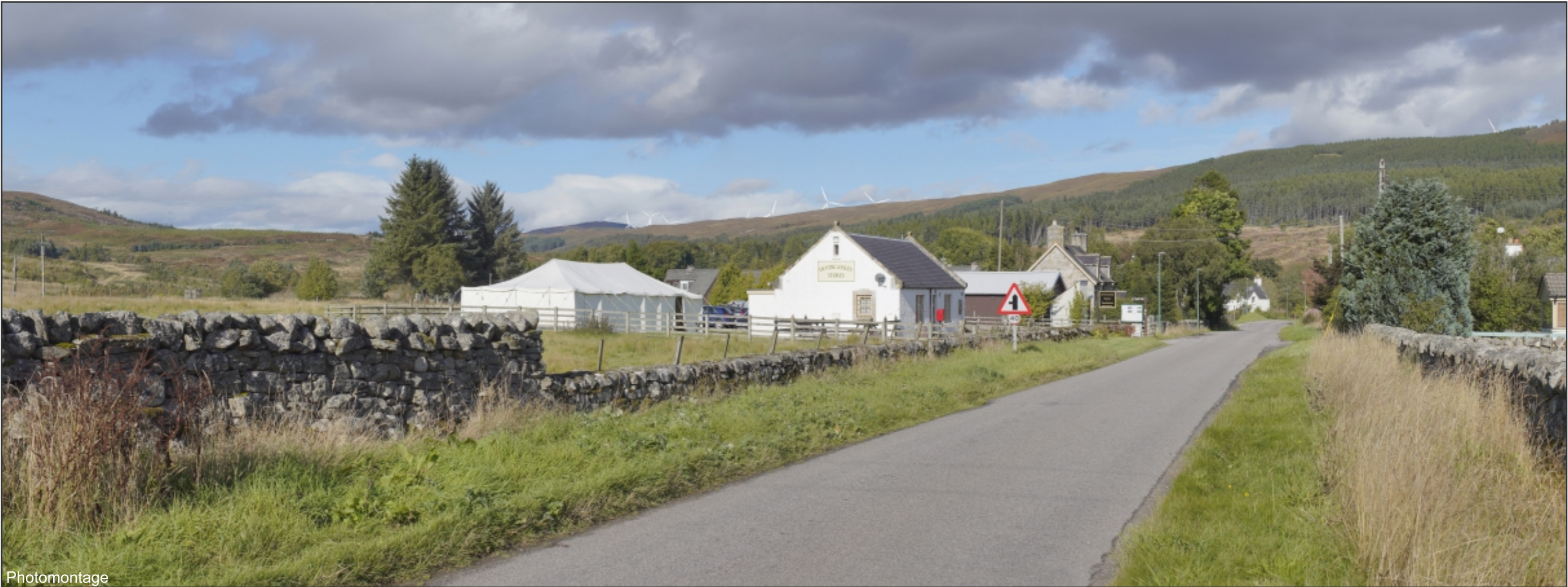
FIGURE 3b - VP6: Rosehall - Revised Layout

OS reference: 247028 E 902032 N Distance to development: 4.7km Ground level: 16.6m AOD Direction of view: 355.5° Camera: Sony ILCE-7RM3 Focal length: 50mm vertical (27°) x 28mm horizontal (65.5°) Camera height: 1.5m Date: 02/10/2020 Time: 13:56 Drawing No. - 122003-D-AI-3b-1.0.0 Date - 09.02.2022