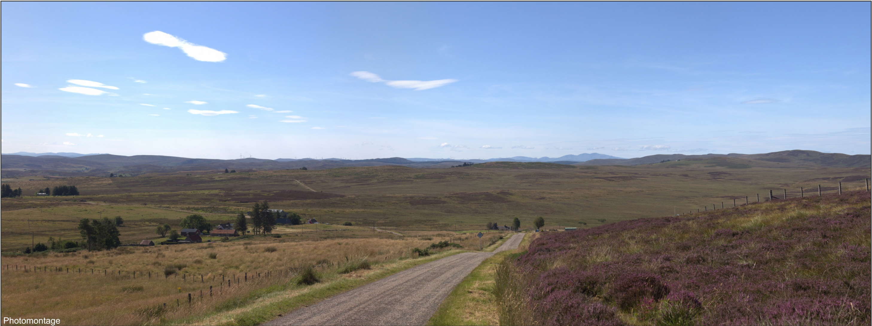
FIGURE 7.33.2 - VP4: Rhilochan

OS reference: 274824 E 906805 N Distance to development: 27.3km Ground level: 211.7m AOD Direction of view: 274.1° Camera: Canon EOS 6D Focal length: 50mm vertical (27°) x 28mm horizontal (65.5°) Camera height: 1.5m Date: 06/08/2020 Time: 15:19 Drawing No. - 120008-D-EIA7.33.2-3-1.0.0 Date - 05.05.2021