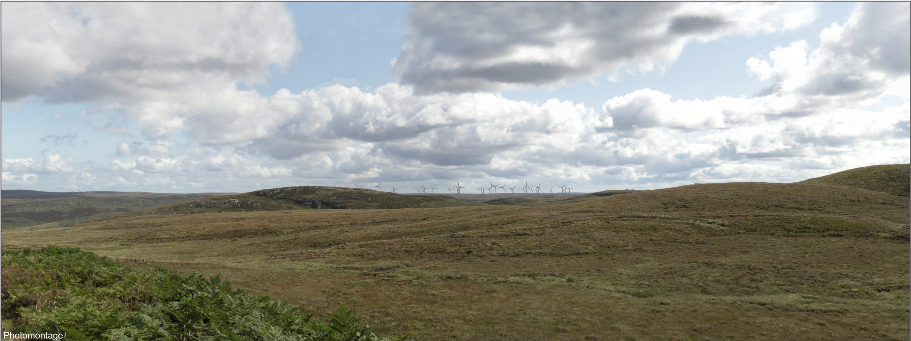
FIGURE 4.9b - VP7: A836 west of the B871 Photomontage

OS reference: 269437 E 957272 N Distance to development: 9.6km Ground level: 137.76m AOD Direction of view: 120.70° Camera: Canon EOS 5D Mk II Focal length: 50mm vertical (27°) x 28mm horizontal (65.5°) Camera height: 1.5m Date: 15/08/19 Time: 12:31 Drawing No. - 121002-D-SI4.9b-1.0.0 Date - 12/07/2021