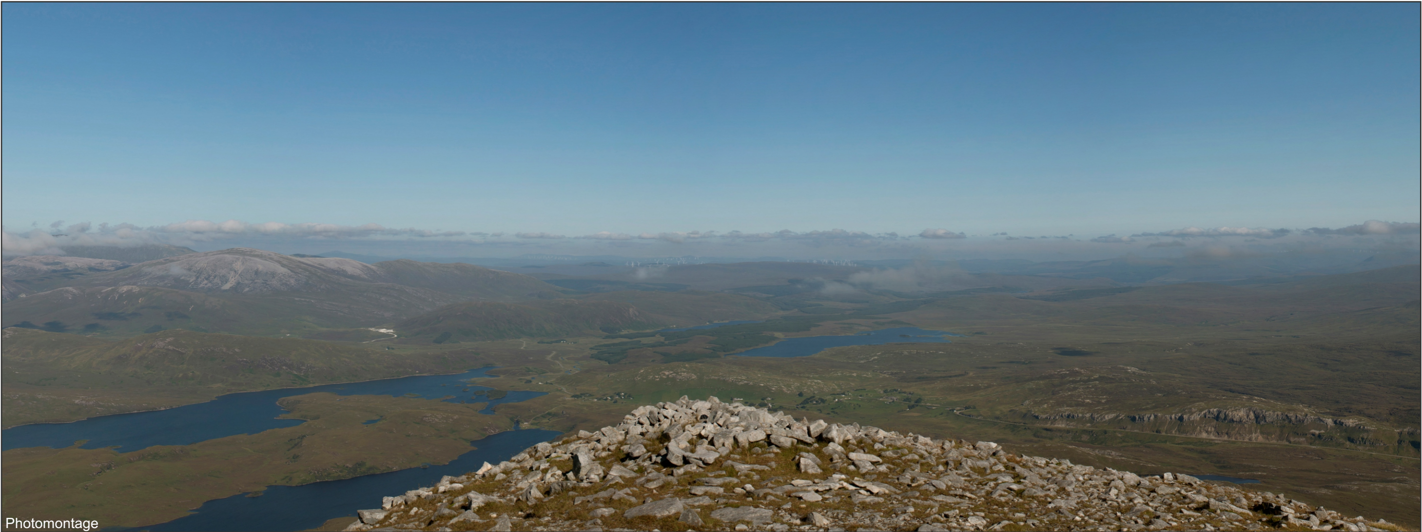
FIGURE 7.49.2 - VP20: Cul Mòr

OS reference: 216208 E 911909 N Distance to development: 28.4km Ground level: 848.9m AOD Direction of view: 96.0° Camera: Sony ILCE-7RM3 Focal length: 50mm vertical (27°) x 28mm horizontal (65.5°) Camera height: 1.5m Date: 14/08/2020 Time: 17:01 Drawing No. - 120008-D-EIA7.49.2-3-1.0.0 Date - 05.05.2021