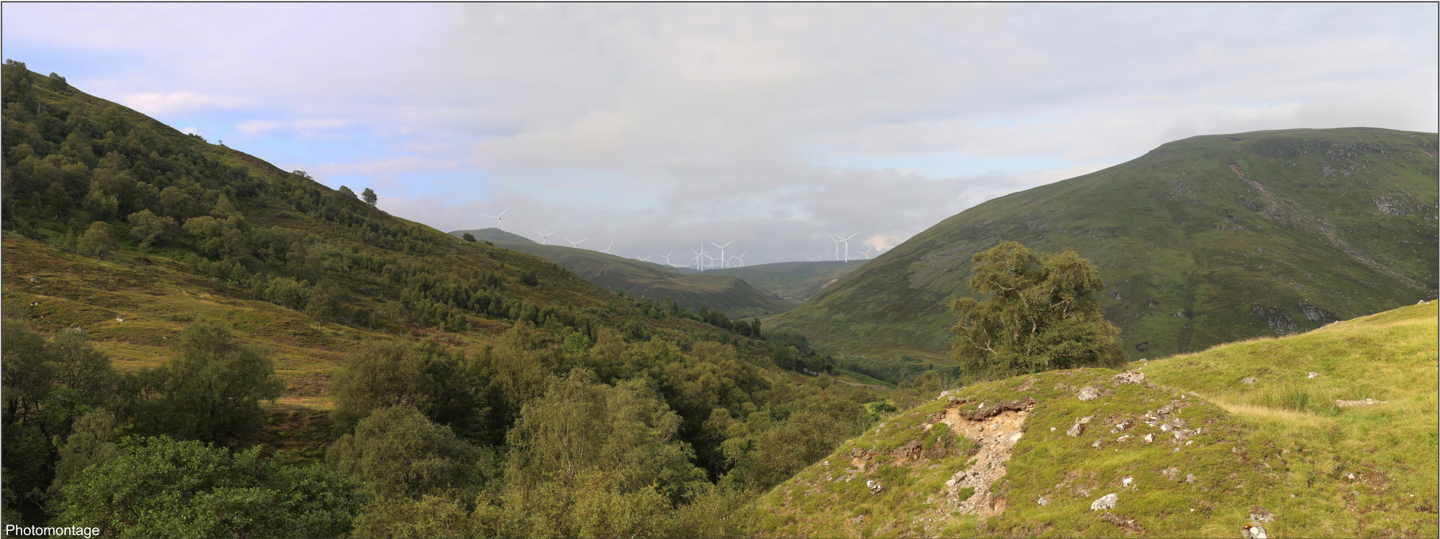
FIGURE 7.10.6.2 - VP6: Glen Markie

OS reference: 254356 E 807217 N Distance to development: 7.4km Ground level: 439.4m AOD Direction of view: 228.00° Camera: Canon EOS 6D Focal length: 50mm vertical (27°) x 28mm horizontal (65.5°) Camera height: 1.5m Date: 31/07/2019 Time: 08:27 Drawing No. - 118025-D-LVIA7.10.6.2-3-1.0.0 Date - 17.04.2020