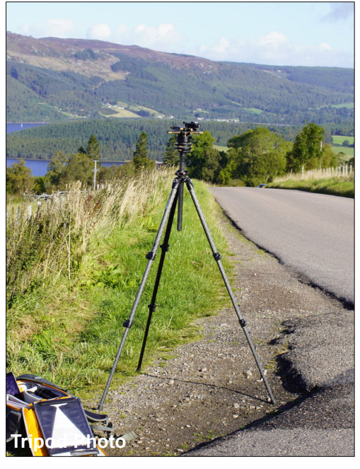
Figure 8.25.4 Photomontage

Figure 8.25.1 Location Plan Figure 8.25.2 Baseline Photo and Cumulative Wireline Figure 8.25.3 Wireline