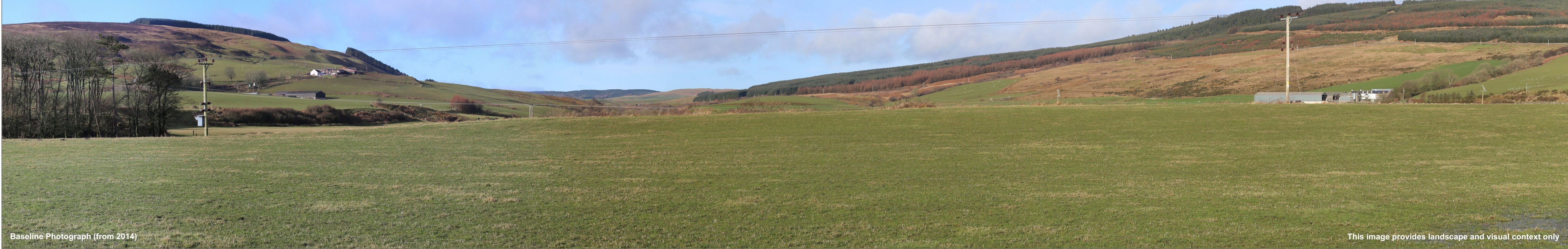
Baseline Photograph (from 2014)

This image provides landscape and visual context only