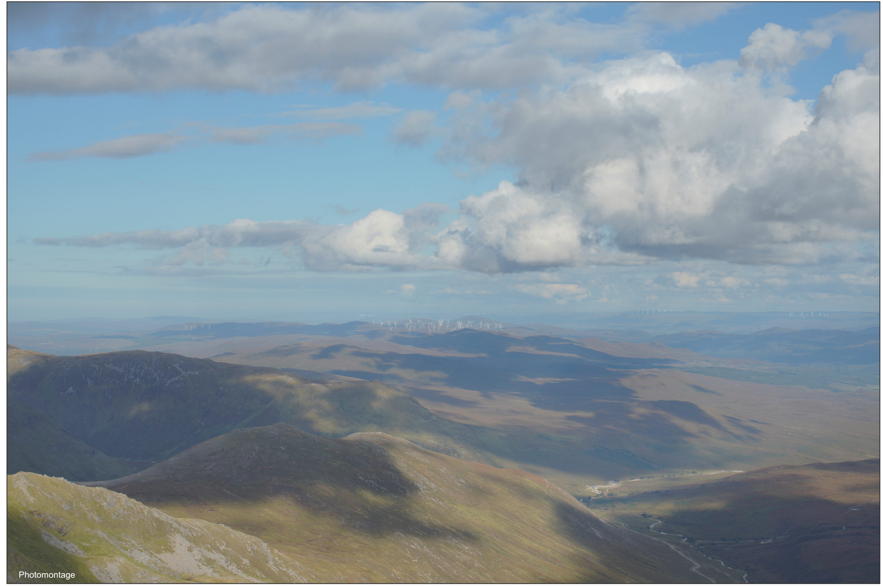
FIGURE 8.47.4 - VP 13: Sgùrr nan Conbhairean

When viewed at a comfortable arms length (approx. 500mm), this printed image is representative of our detailed central vision, but is not representative of scale and distance.