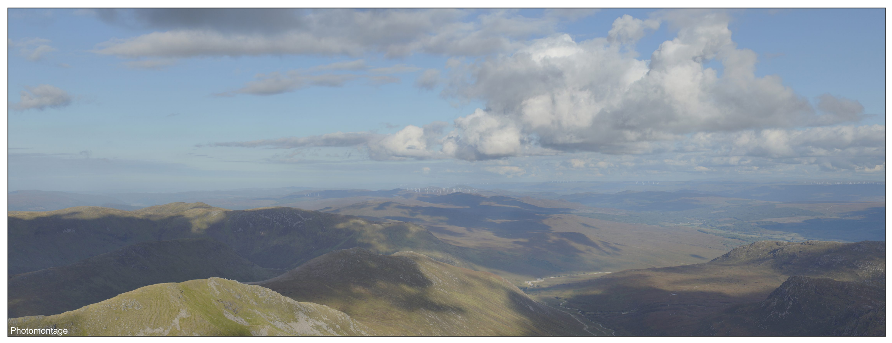
FIGURE 8.47.2 - VP13: Sgùrr nan Conbhairean