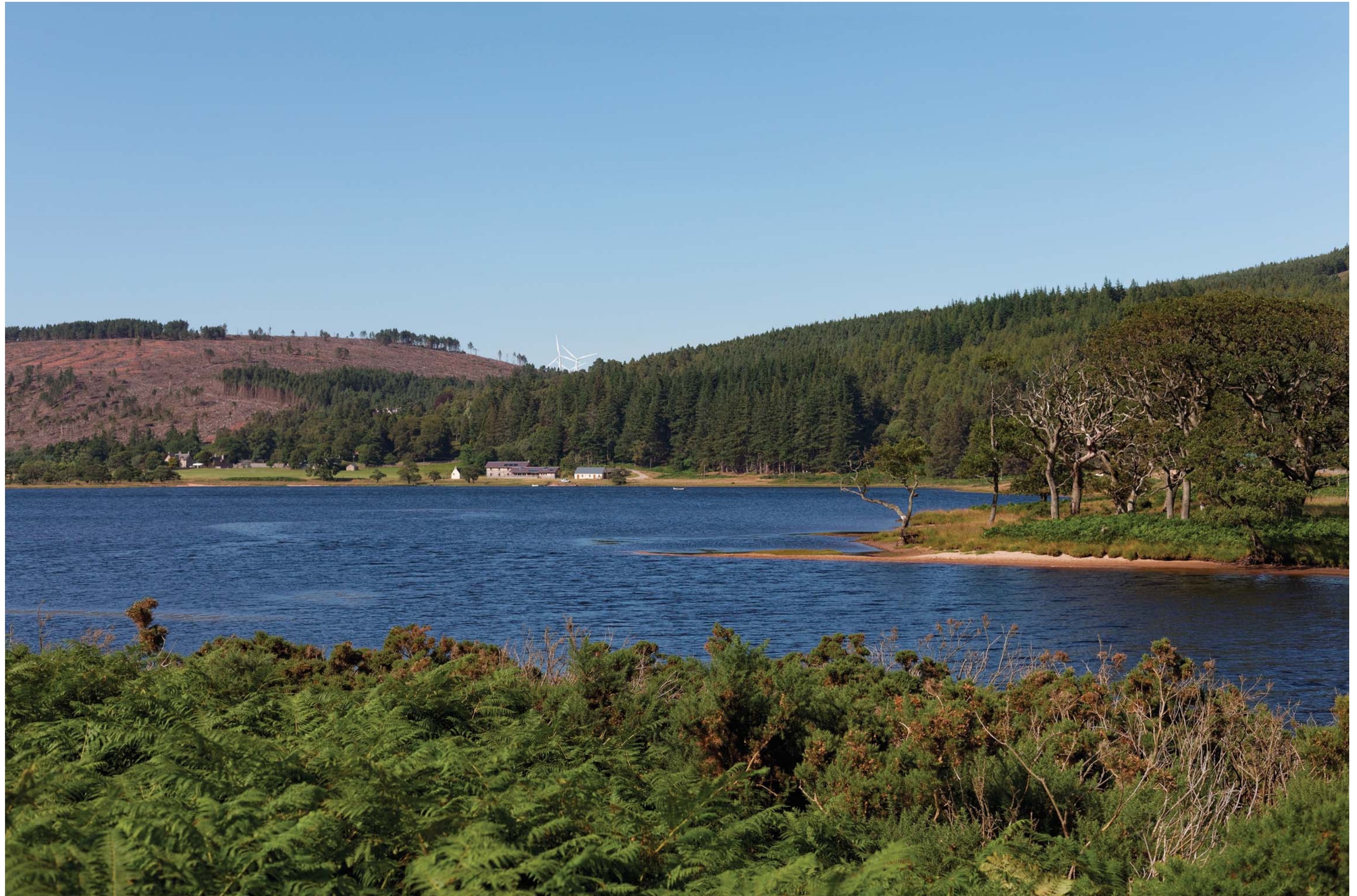
Viewpoint 2: Loch Brora (south-west side)