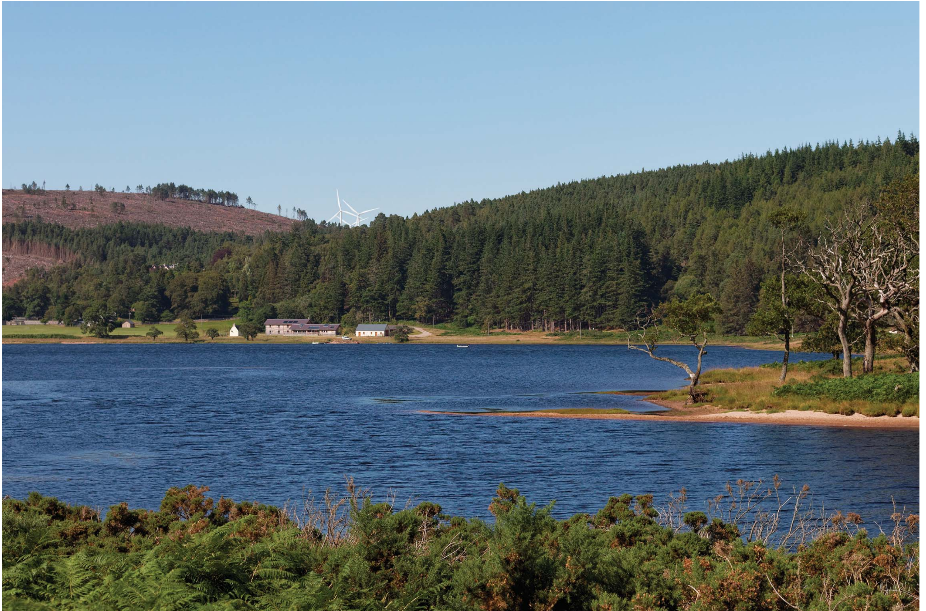
Viewpoint 2: Loch Brora (south-west side)