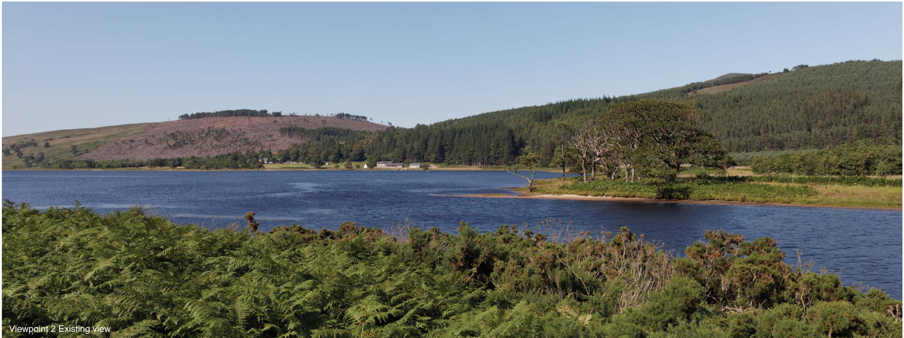
Viewpoint 2 Existing view