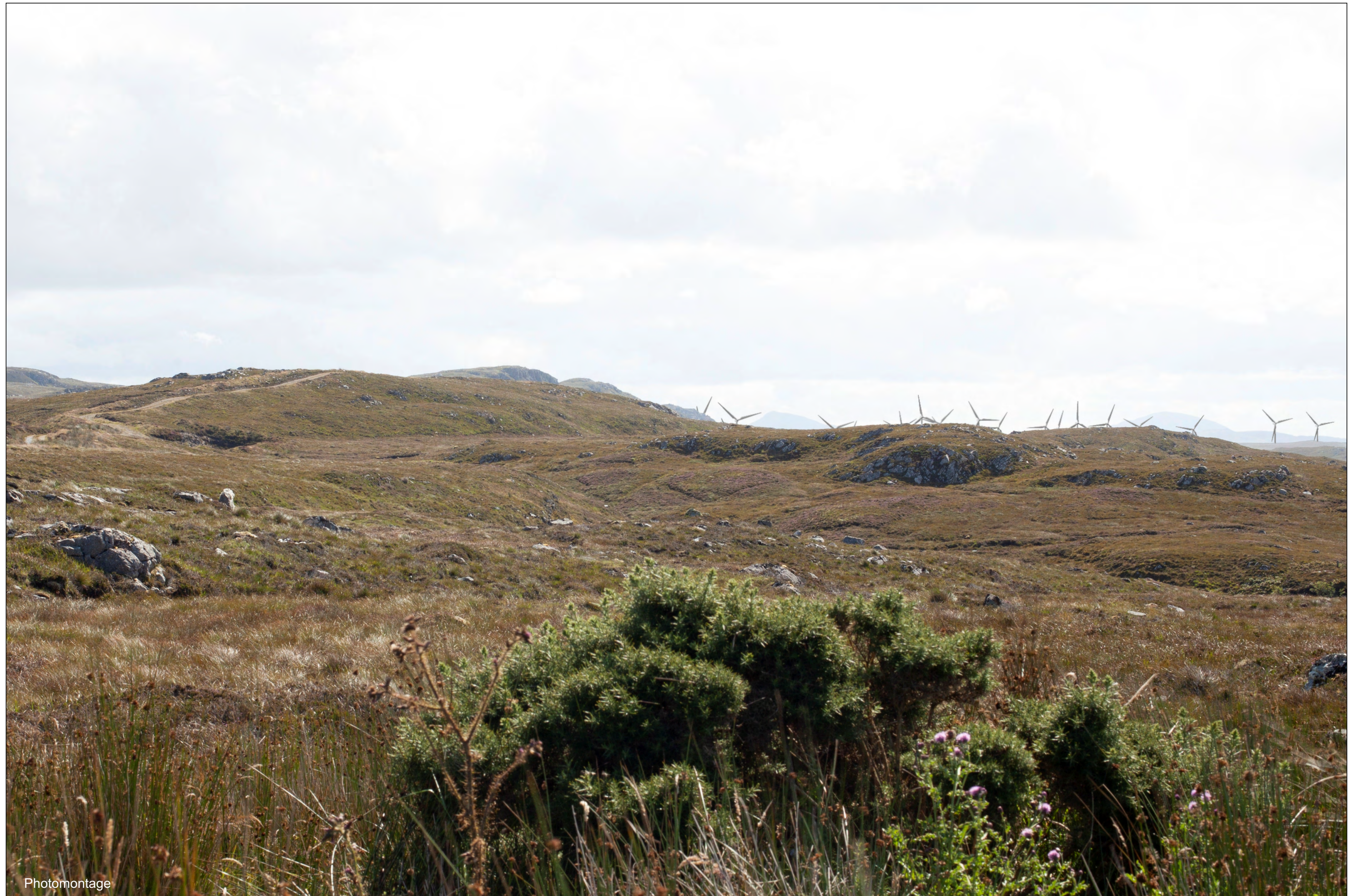
FIGURE 4.28e - VP 6: Bettyhill viewpoint 75mm Single Frame Photomontage This image should be viewed at a comfortable arms length (approx 500mm)

OS reference: 274862 E 961925 N Distance to development: 9.1km Ground level: 127.50m AOD Direction of view: 156.91° Camera: Canon EOS 5D Mk II Focal length: 75mm Camera height: 1.5m Date: 15/08/19 Time: 12:01 Drawing No. - 119008-D-LV4.28e-1.0.0 Date - 22/06/2020