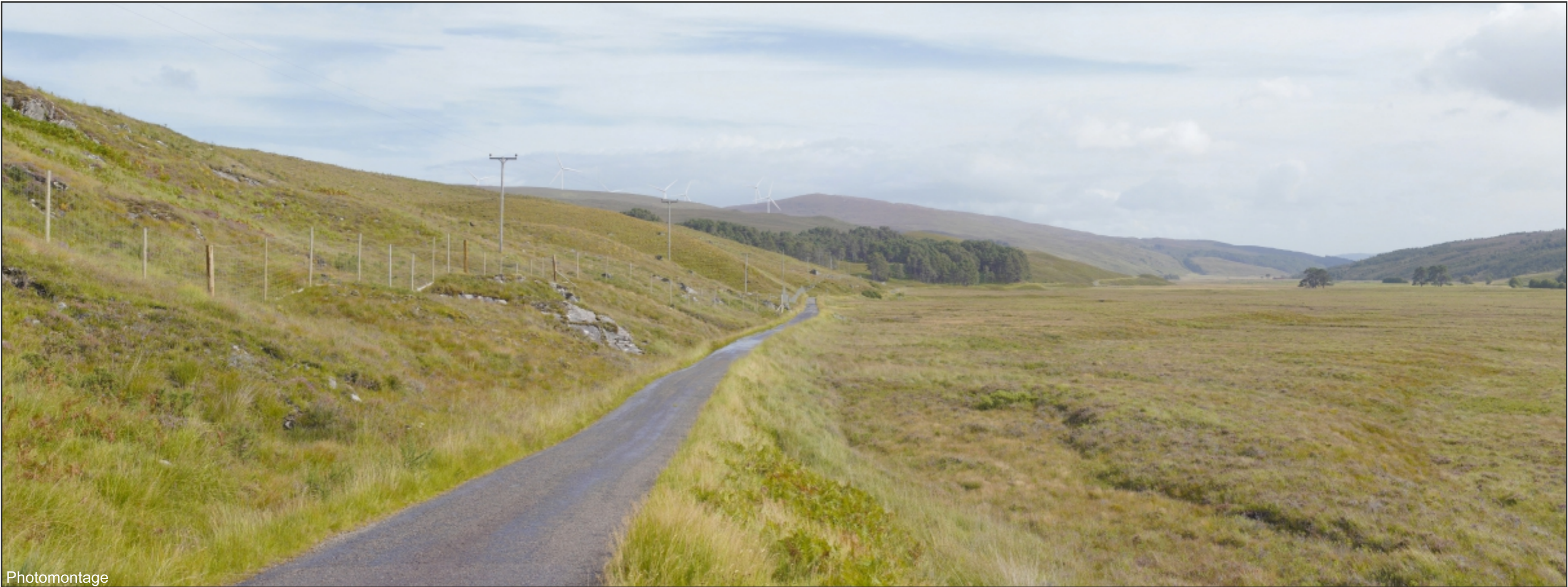
FIGURE 5b - VP12: Glencassley road by Langwell Hill - Revised Layout

OS reference: 240664 E 912269 N Distance to development: 4.1km Ground level: 79.8m AOD Direction of view: 119.0° Camera: Sony ILCE-7RM3 Focal length: 50mm vertical (27°) x 28mm horizontal (65.5°) Camera height: 1.5m Date: 12/09/2020 Time: 14:33 Drawing No. - 122003-D-AI-5b-1.0.0 Date - 09.02.2022