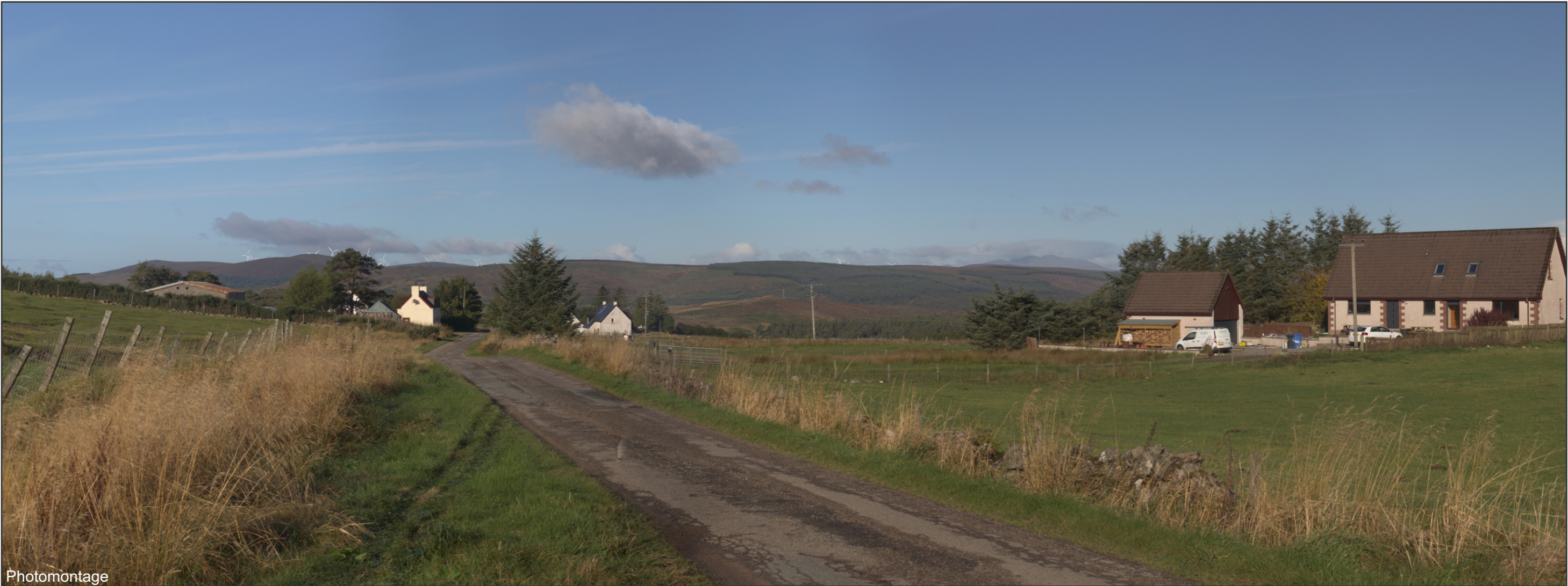
FIGURE 7.36.2 - VP7: High Road

OS reference: 260226 E 904804 N Distance to development: 12.9km Ground level: 175.3m AOD Direction of view: 285.9° Camera: Canon EOS 6D Focal length: 50mm vertical (27°) x 28mm horizontal (65.5°) Camera height: 1.5m Date: 23/09/2020 Time: 10:13 Drawing No. - 120008-D-EIA7.36.2-3-1.0.0 Date - 05.05.2021