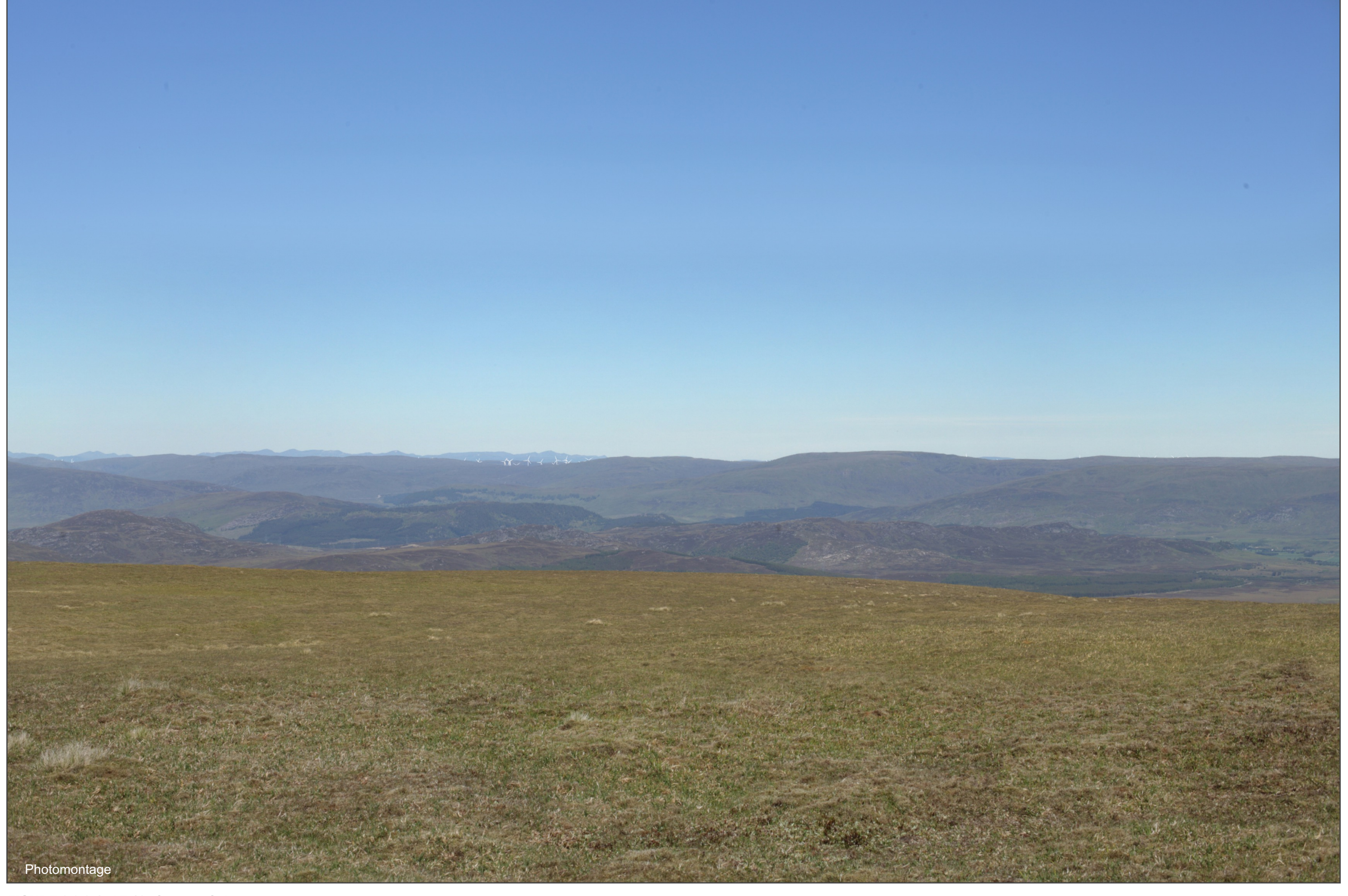
FIGURE 3.9.9.4 - VP19: Carn na Caim When viewed at a comfortable arms length (approx. 500mm), this printed image is representative of our detailed central vision, but is not representative of scale and distance.