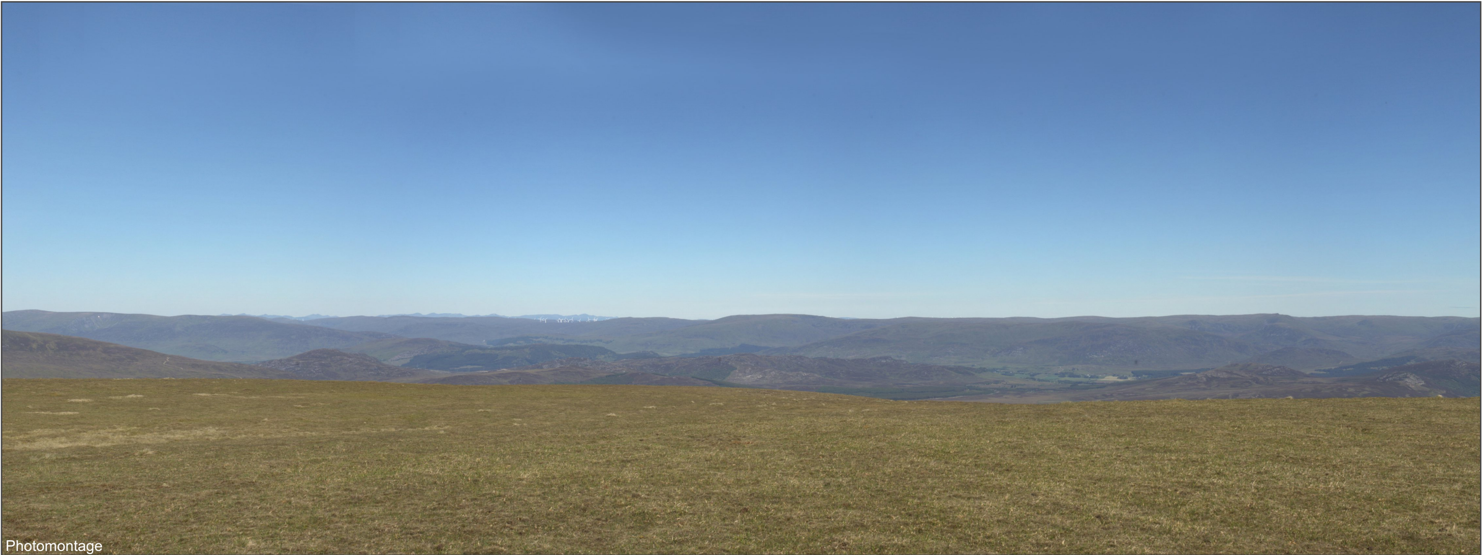
FIGURE 7.10.19.2 - VP19: Carn na Caim

OS reference: 267701 E 782147 N Distance to development: 22.7km Ground level: 939.64m AOD Direction of view: 323.49° Camera: Canon EOS 5D Mk II Focal length: 50mm vertical (27°) x 28mm horizontal (65.5°) Camera height: 1.5m Date: 27/06/2019 Time: 09:49 Drawing No. - 118025-D-LVIA7.10.19.2-3-1.0.0 Date - 17.04.2020