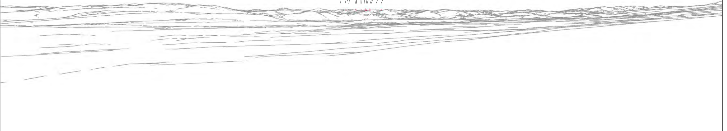
FIGURE 8.59.3 - VP25: Minor road near Tore