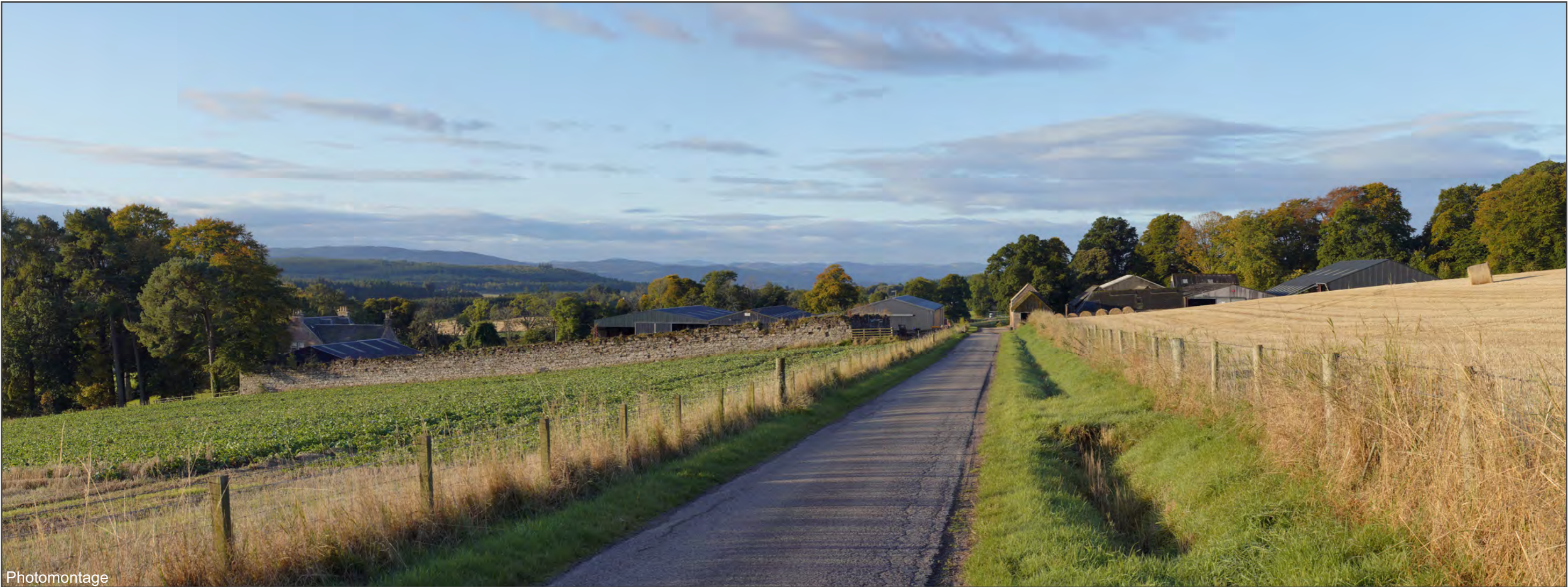
FIGURE 8.59.2 - VP25: Minor road near Tore

OS reference: 261234 E 853906 N Nearest visible turbine: 38.2km Ground level: 115.6m AOD Direction of view: 213.8° Camera: Sony A7RIII ILCE-7RM3 Focal length: 50mm vertical (27°) x 28mm horizontal (65.5°) Camera height: 1.5m Date: 08/10/2020 Time: 08:46 Drawing No. - 119009-D-8.59.2-3-1.0.0 Date - 04/08/2021