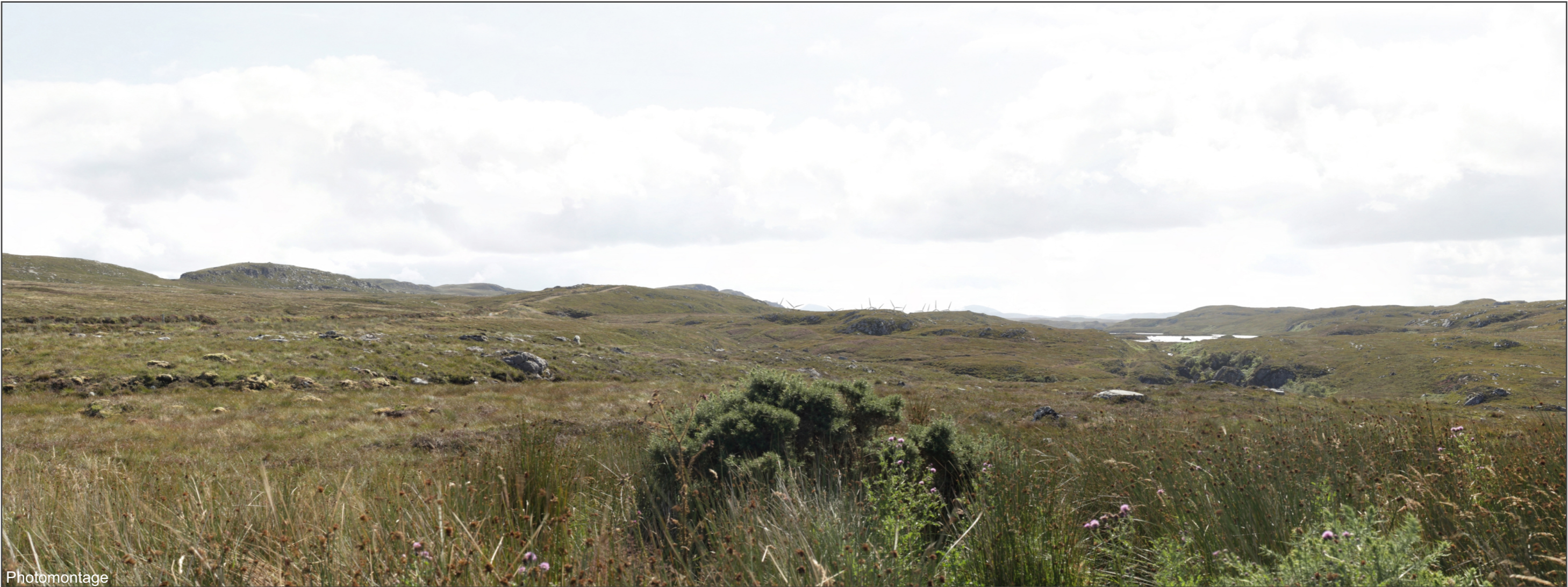
FIGURE 4.8b - VP6: Bettyhill Viewpoint Photomontage

OS reference: 274862 E 961925 N Distance to development: 9.1km Ground level: 127.50m AOD Direction of view: 156.91° Camera: Canon EOS 5D Mk II Focal length: 50mm vertical (27°) x 28mm horizontal (65.5°) Camera height: 1.5m Date: 15/08/19 Time: 12:01 Drawing No. - 121002-D-S14.8b-1.0.0 Date - 12/07/2021