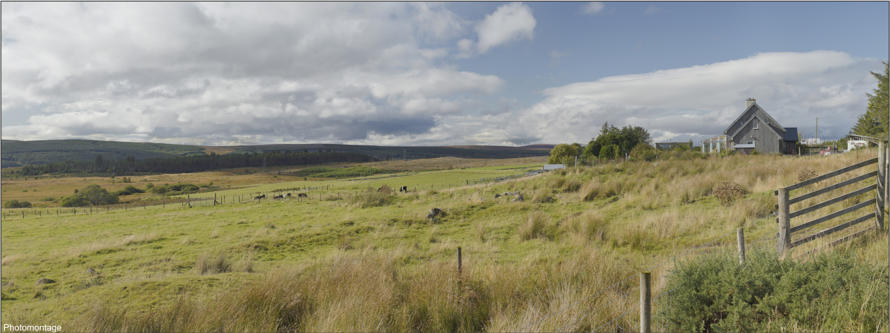
FIGURE 7.32.2 - VP3: Saval

OS reference: 259173 E 908273 N Distance to development: 11.7km Ground level: 164.3m AOD Direction of view: 271.8° Camera: Sony ILCE-7RM3 Focal length: 50mm vertical (27°) x 28mm horizontal (65.5°) Camera height: 1.5m Date: 2/10/2020 Time: 13:12 Drawing No. - 120008-D-EIA7.32.2-3-1.0.0 Date - 05.05.2021