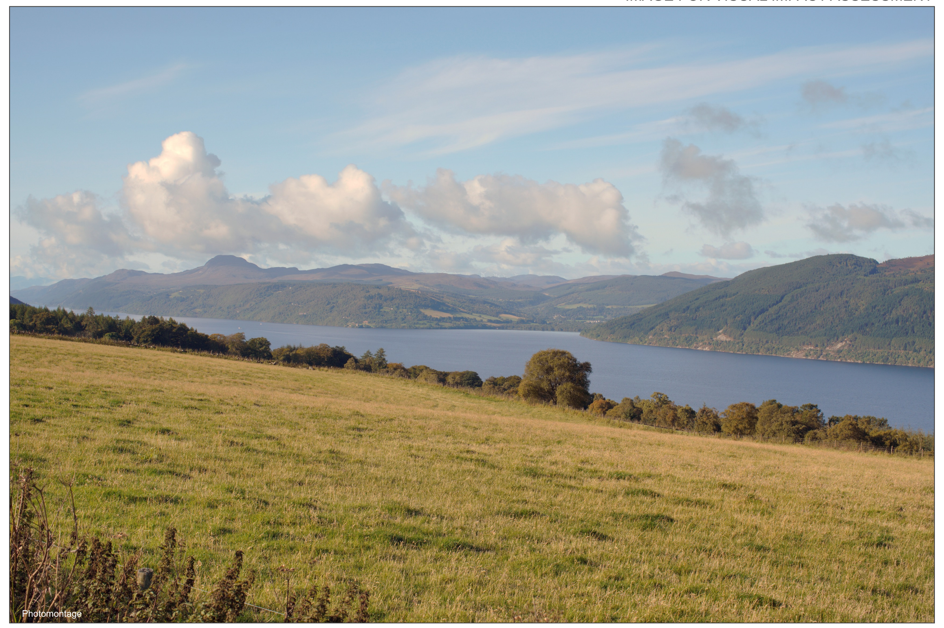
FIGURE 7d - VP 17: B862 south of Dores (15 Turbine Layout)