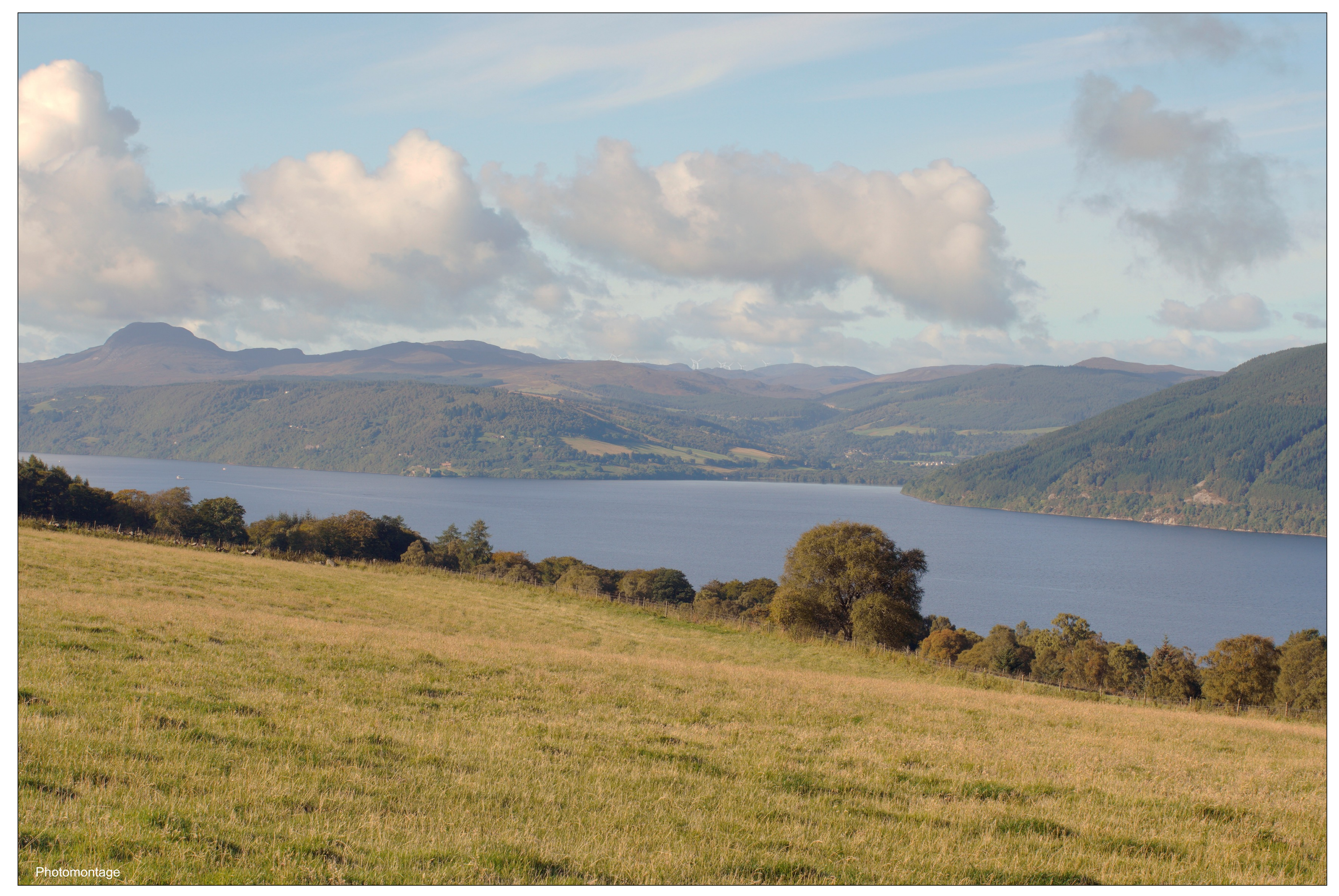
FIGURE 7e - VP 17: B862 south of Dores (15 Turbine Layout) This image should be viewed at a comfortable arms length (approx 500mm)