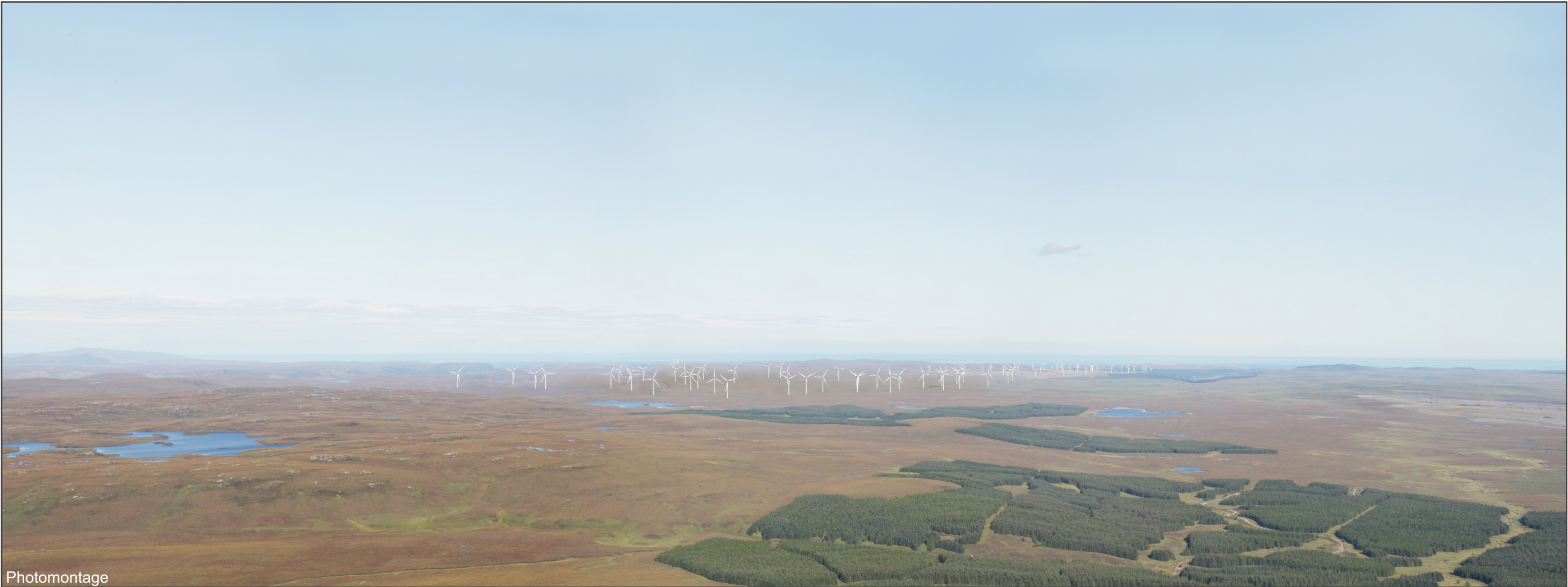
FIGURE 4.23b - VP1: Ben Griam Beg Photomontage

OS reference: 283185 E 941167 N Distance to development: 8.6km Ground level: 574.49m AOD Direction of view: 339.45° Camera: Canon EOS 5D Mk II Focal length: 50mm vertical (27°) x 28mm horizontal (65.5°) Camera height: 1.5m Date: 26/08/19 Time: 10:08 Drawing No. - 119008-D-LV4.23b-1.0.0 Date - 22/06/2020