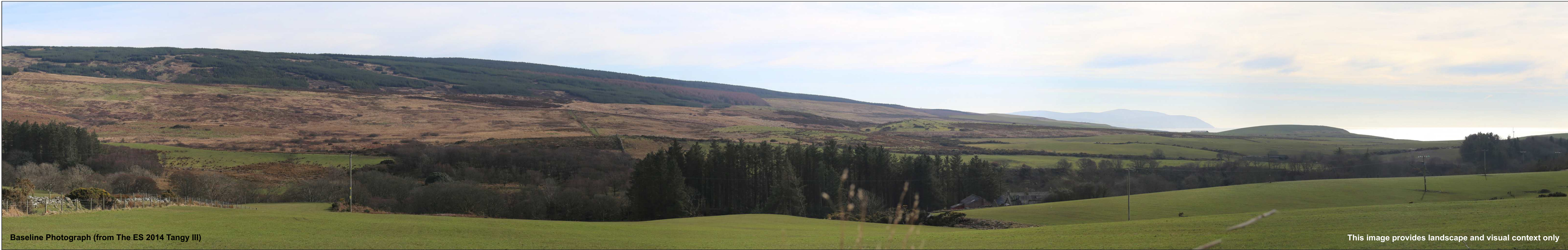
Baseline Photograph (from The ES 2014 Tangy III)

This image provides landscape and visual context only