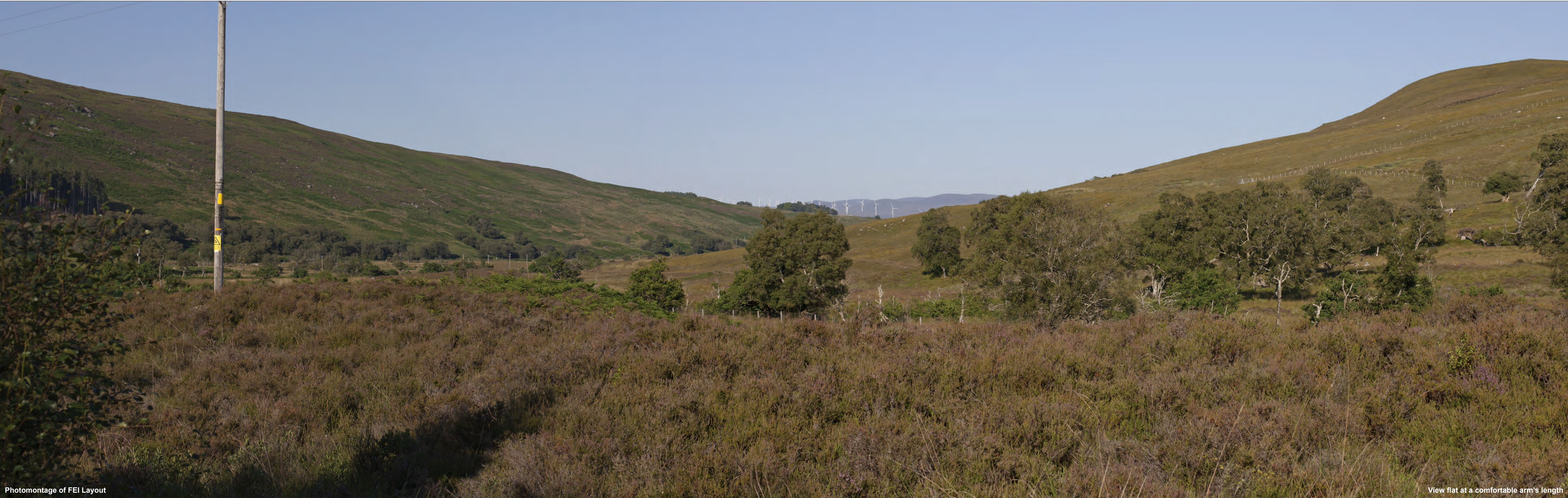
Photomontage of FEI Layout