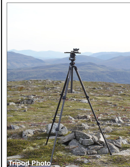
Figure 8.19.1 Location Plan Figure 8.19.2-1-2 Baseline Photo and Cumulative Wireline Figure 8.19.3 Wireline Figure 8.19.4 Photomontage