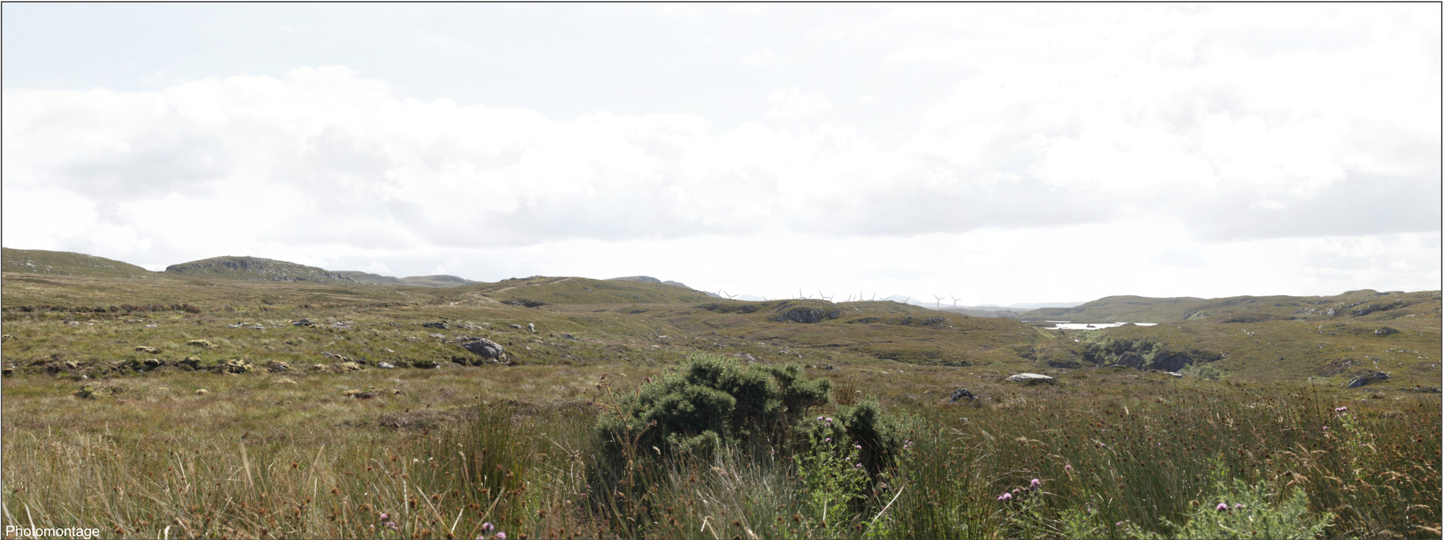
FIGURE 4.28b - VP6: Bettyhill Viewpoint Photomontage

OS reference: 274862 E 961925 N Distance to development: 9.1km Ground level: 127.50m AOD Direction of view: 156.91° Camera: Canon EOS 5D Mk II Focal length: 50mm vertical (27°) x 28mm horizontal (65.5°) Camera height: 1.5m Date: 15/08/19 Time: 12:01 Drawing No. - 119008-D-LV4.28b-1.0.0 Date - 22/06/2020