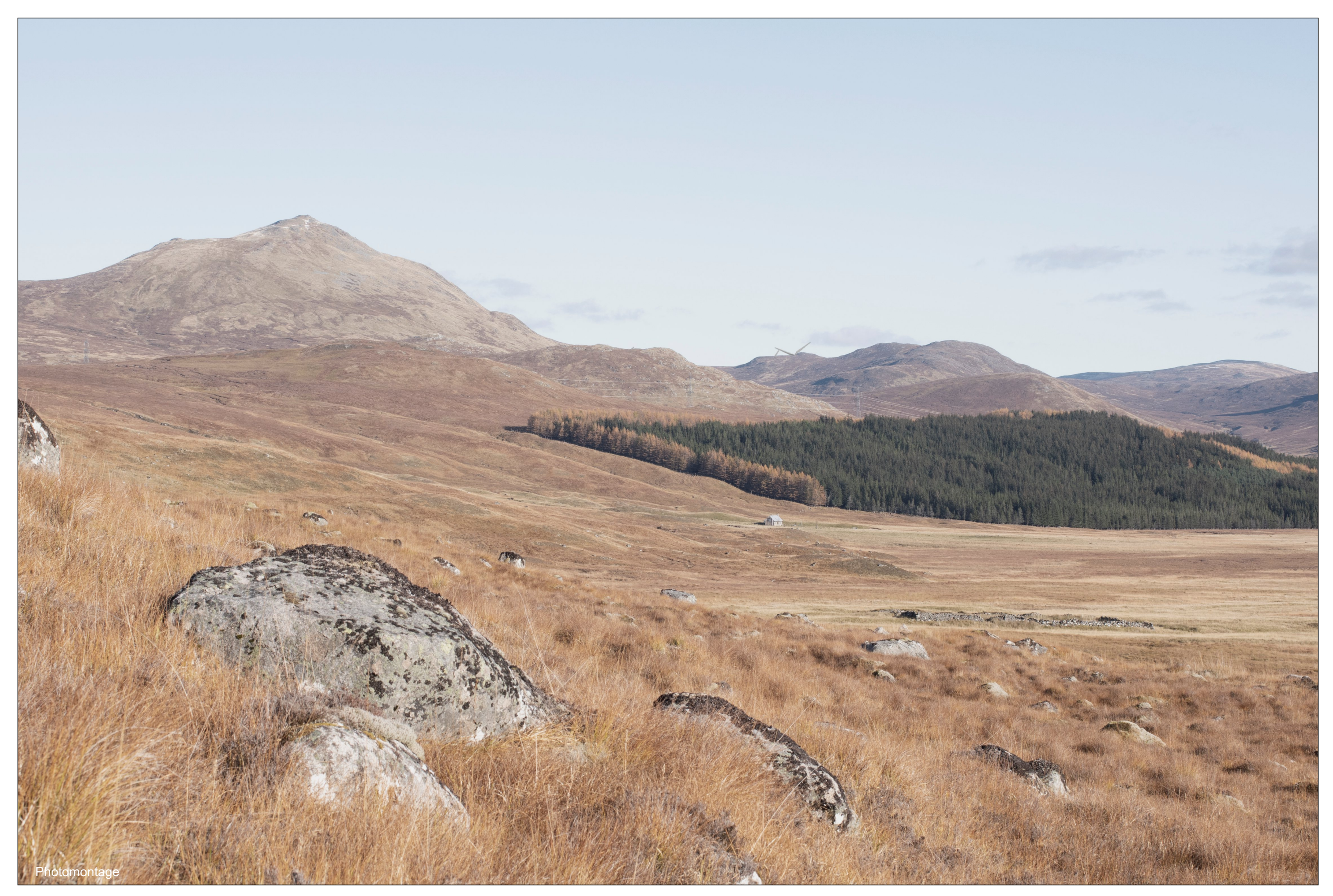
OS reference: 242847 E 794138 N Distance to development: 9.1km Ground level: 365.4m AOD Camera: Nikon D810 Focal length: 75mm Camera height: 1.5m Date: 31/10/2019 Time: 11:12