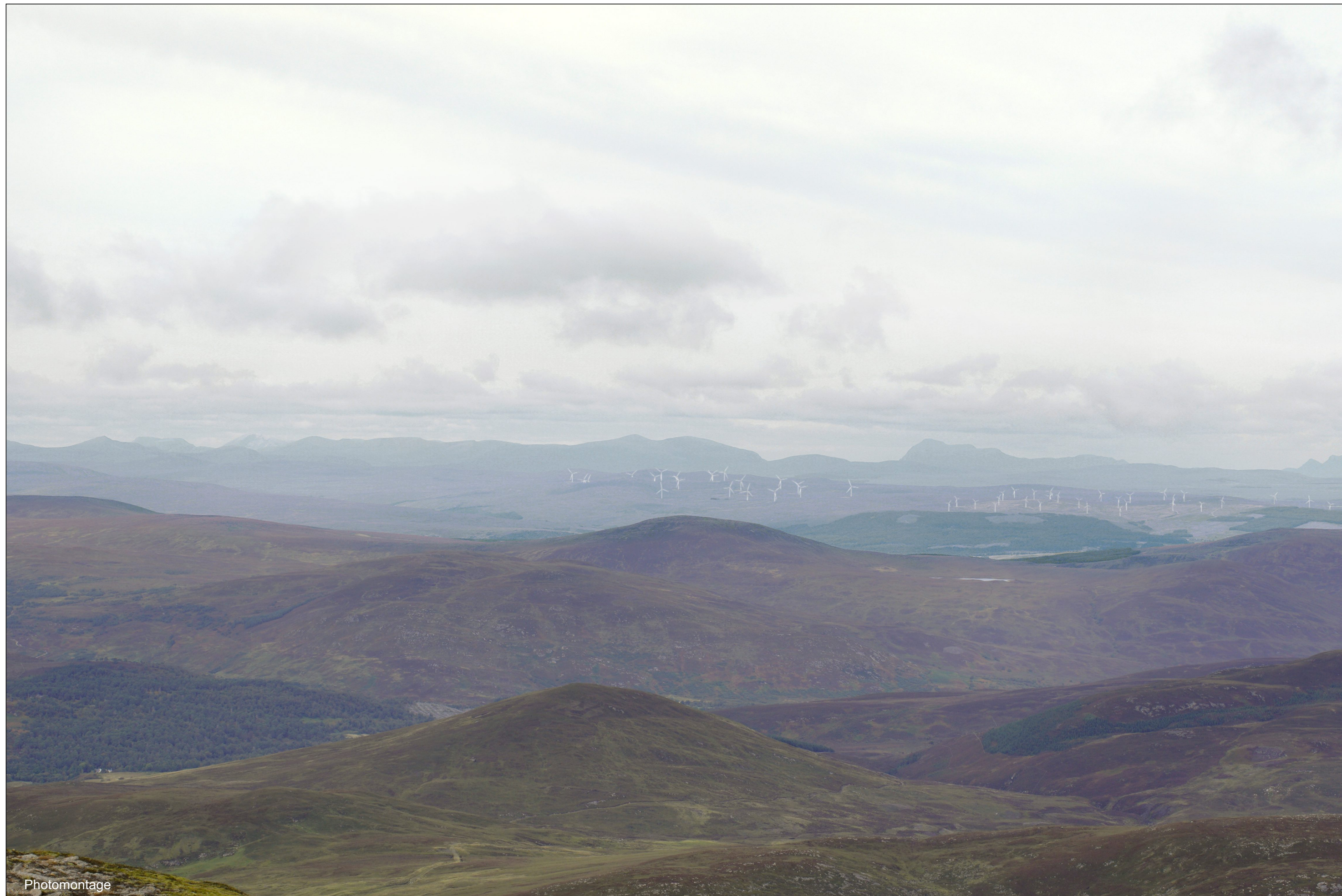
FIGURE 7.47.5 - VP18: Carn Chuinneag

This image should be viewed at a comfortable arms length (approx 500mm)