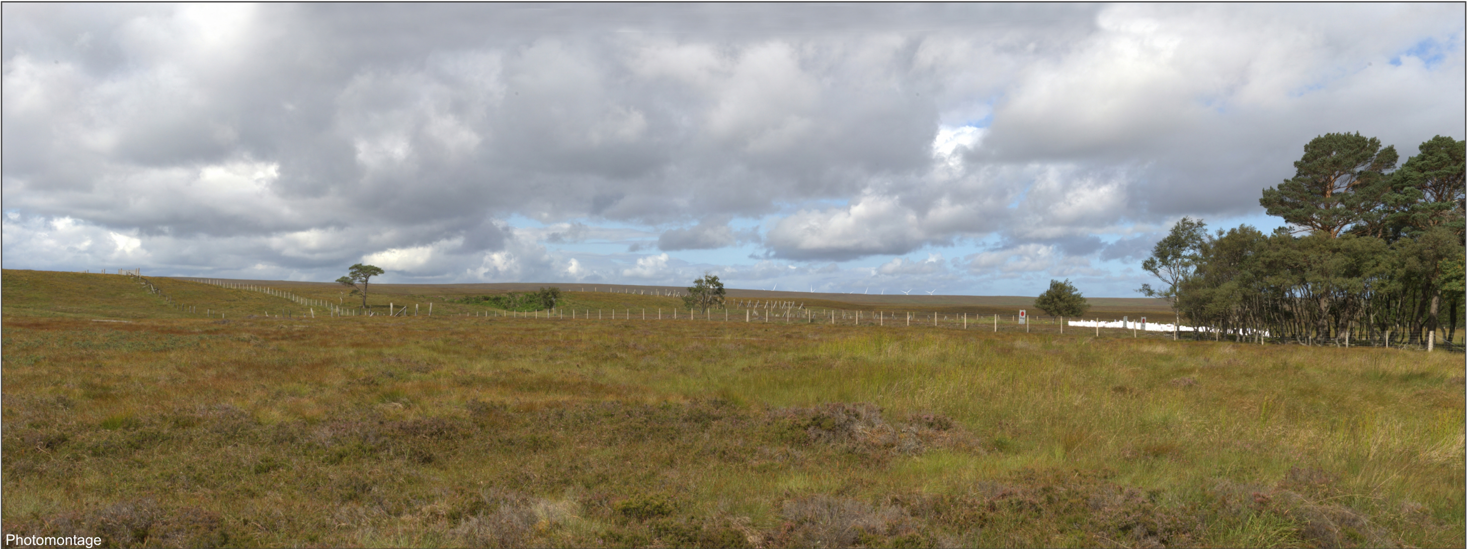
FIGURE 4.11b - VP11: Forsinard Photomontage

OS reference: 288982 E 942360 N Distance to development: 11.0km Ground level: 158.74m AOD Direction of view: 313.15° Camera: Canon EOS 5D Mk II Focal length: 50mm vertical (27°) x 28mm horizontal (65.5°) Camera height: 1.5m Date: 15/08/19 Time: 11:09 Drawing No. - 121002-D-SI4.11b-1.0.0 Date - 12/07/2021