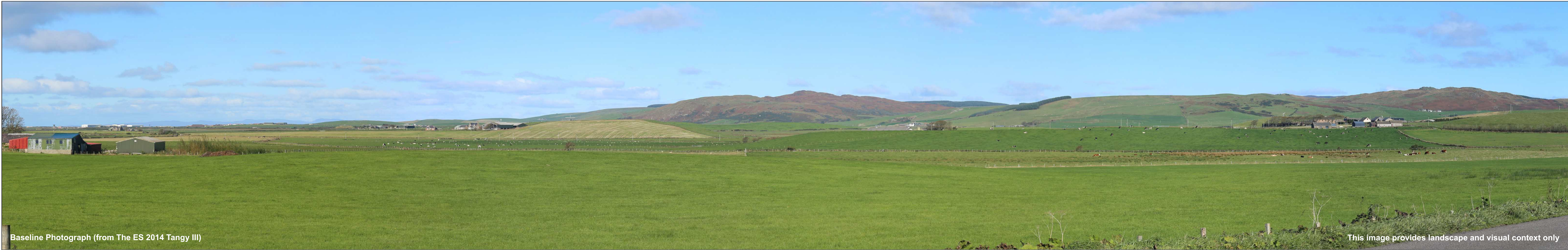
Baseline Photograph (from The ES 2014 Tangy III)

This image provides landscape and visual context only