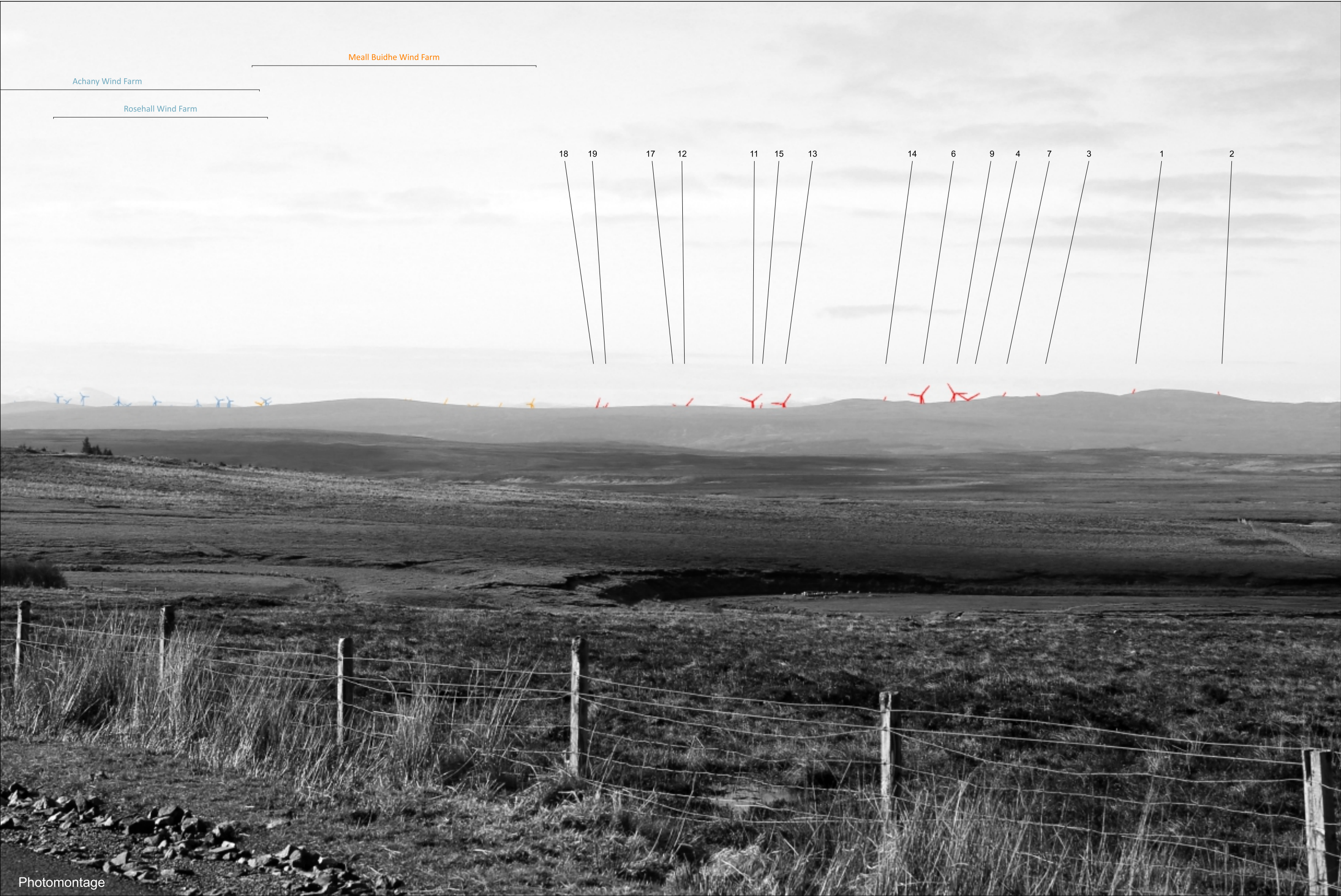
FIGURE 1f - VP1: A836 above the Crask Inn - Revised Layout - Monochrome Analysis This image should be viewed at a comfortable arms length (approx 500mm)

OS reference: 252294 E 925050 N Distance to development: 15.6km Ground level: 250.9m AOD Camera: Canon EOS 6D Focal length: 75mm Camera height: 1.5m Date: 01/04/2021 Time: 10:21