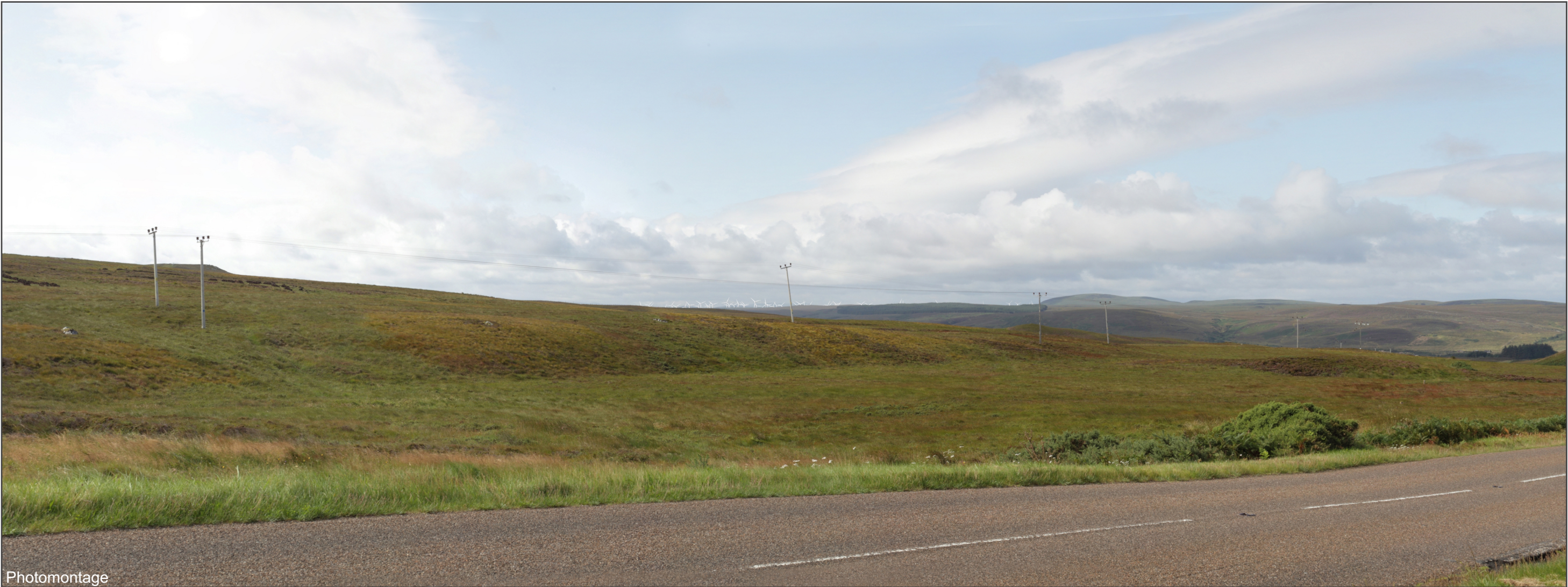
FIGURE 4.26b - VP4: East of Melvich Photomontage

OS reference: 291737 E 964451 N Distance to development: 15.7km Ground level: 91.77m AOD Direction of view: 223.46° Camera: Canon EOS 5D Mk II Focal length: 50mm vertical (27°) x 28mm horizontal (65.5°) Camera height: 1.5m Date: 15/08/19 Time: 09:57 Drawing No. - 119008-D-LV4.26b-1.0.0 Date - 22/06/2020