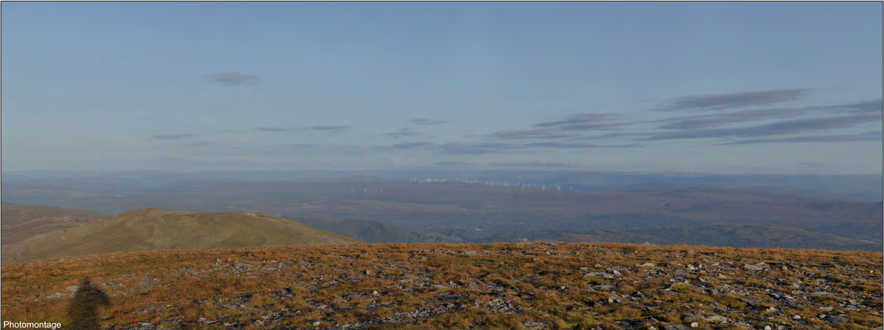
FIGURE 8.55.2 - VP21: Toll Creagach

OS reference: 219449 E 828285 N Nearest visible turbine: 19.8km Ground level: 1053.5m AOD Direction of view: 109.7° Camera: Sony A7RIII ILCE-7RM3 Focal length: 50mm vertical (27°) x 28mm horizontal (65.5°) Camera height: 1.5m Date: 17/09/2020 Time: 18:22 Drawing No. - 119009-D-8.55.2-3-1.0.0 Date - 03/08/2021