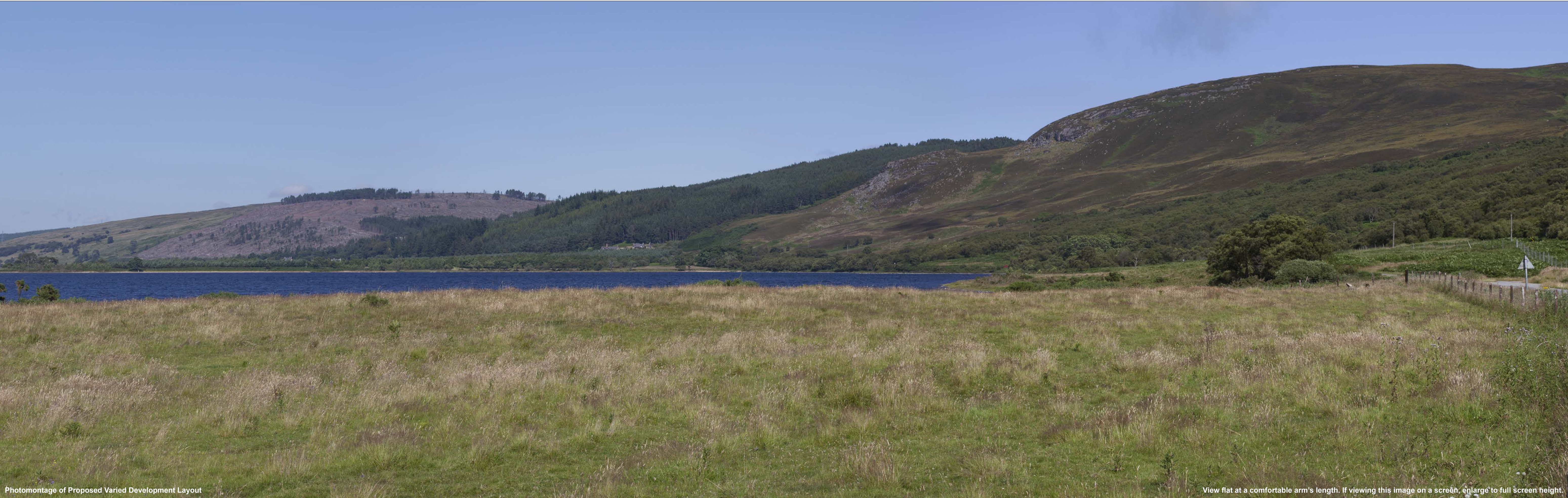
Photomontage of Proposed Varied Development Layout

View flat at a comfortable arm's length. If viewing this image on a screen, enlarge to full screen height.