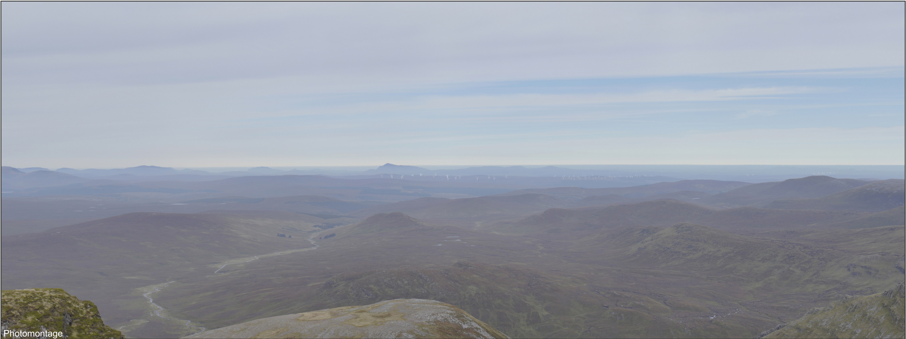
FIGURE 7.48.2 - VP19: Seana Bhràigh

OS reference: 228181 E 887872 N Distance to development: 26.5km Ground level: 927.4m AOD Direction of view: 41.0° Camera: Sony ILCE-7RM3 Focal length: 50mm vertical (27°) x 28mm horizontal (65.5°) Camera height: 1.5m Date: 27/09/2020 Time: 14:09 Drawing No. - 120008-D-EIA7.48.2-3-1.0.0 Date - 05.05.2021