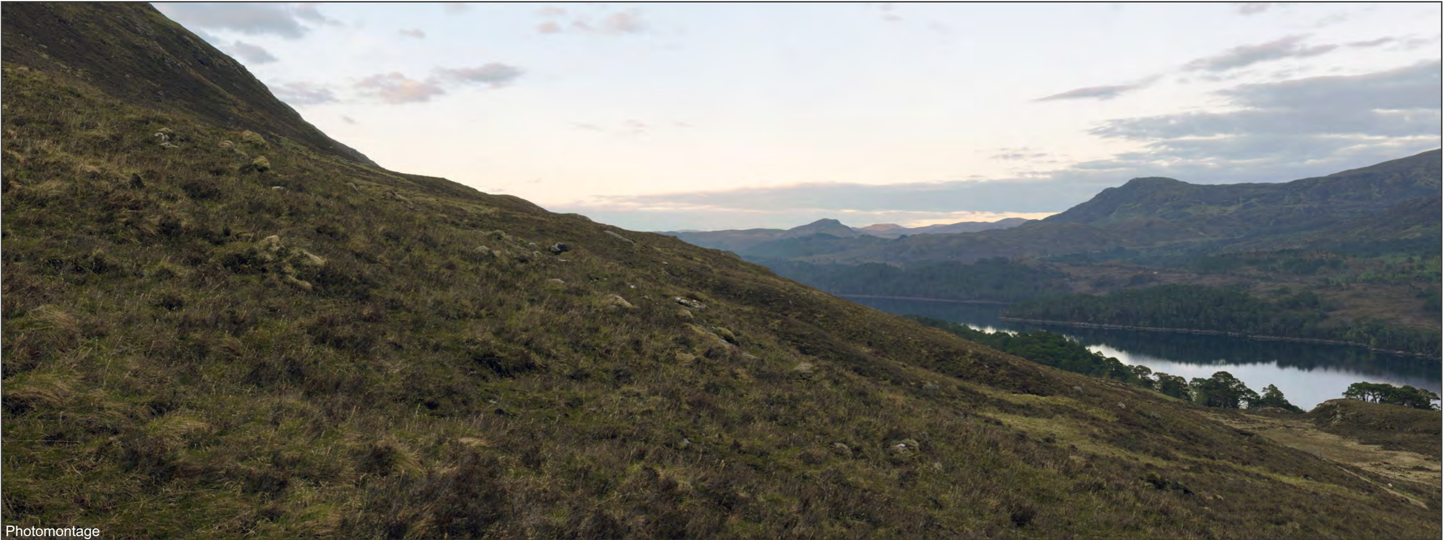
FIGURE 8.53.2 - VP19: Path north of Loch Affric

OS reference: 214810 E 822924 N Nearest visible turbine: 23.4km Ground level: 343.7m AOD Direction of view: 94.1° Camera: Sony A7RIII ILCE-7RM3 Focal length: 50mm vertical (27°) x 28mm horizontal (65.5°) Camera height: 1.5m Date: 27/05/2021 Time: 20:46 Drawing No. - 119009-D-8.53.2-3-2.0.0 Date - 09/08/2021