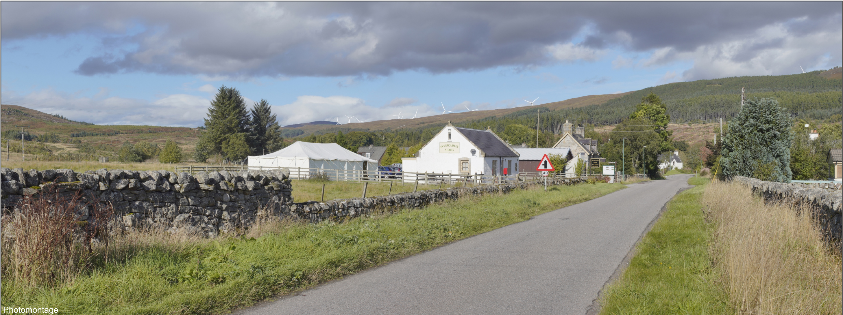
FIGURE 7.35.2 - VP6: Rosehall

OS reference: 247028 E 902032 N Distance to development: 4.7km Ground level: 16.6m AOD Direction of view: 355.5° Camera: Sony ILCE-7RM3 Focal length: 50mm vertical (27°) x 28mm horizontal (65.5°) Camera height: 1.5m Date: 02/10/2020 Time: 13:56 Drawing No. - 120008-D-EIA7.35.2-3-1.0.0 Date - 05.05.2021