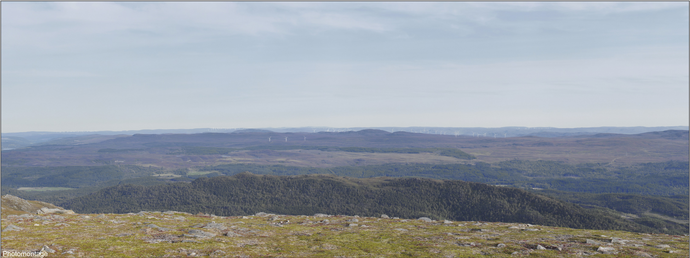
FIGURE 5b - VP11: Meall Mor, Glen Affric (15 Turbine Layout)

OS reference: 224901 E 828054 N Nearest visible turbine: 14.6km Ground level: 692.8m AOD Direction of view: 115.5° Camera: Sony A7RIII ILCE-7RM3 Focal length: 50mm vertical (27°) x 28mm horizontal (65.5°) Camera height: 1.5m Date: 20/09/2020 Time: 16:44 Drawing No. - 121025-D-AIRP-5B-1.0.0 Date - 04.03.2022