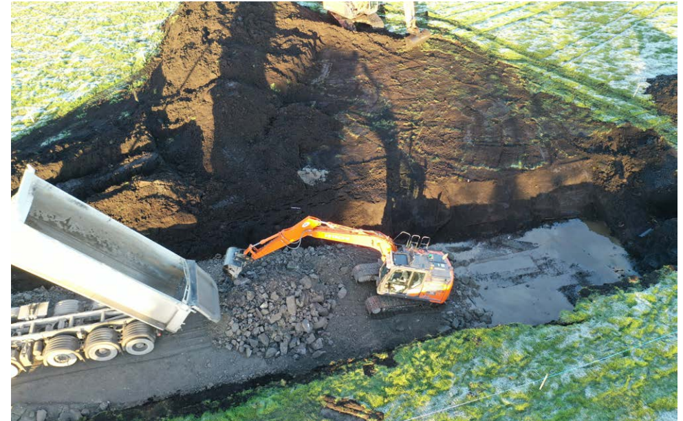
Access Roads & Tracks

Hardstands have been completed at a number of the turbine sites. Forestry works and hedge clearing works are also underway and nearing completion.