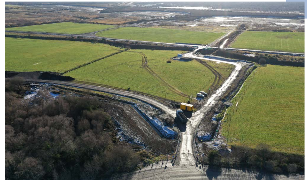
Commencement of Works