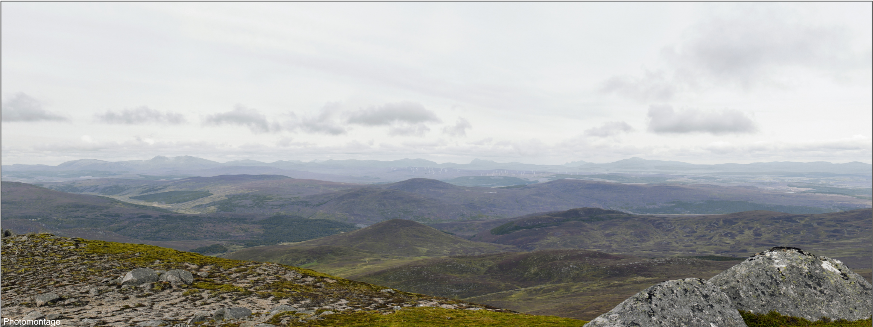
FIGURE 7.47.2 - VP18: Carn Chuinneag

OS reference: 248364 E 883320 N Distance to development: 23.4km Ground level: 834.8m AOD Direction of view: 356.0° Camera: Sony ILCE-7RM3 Focal length: 50mm vertical (27°) x 28mm horizontal (65.5°) Camera height: 1.5m Date: 24/09/2020 Time: 13:07 Drawing No. - 120008-D-EIA7.47.2-3-1.0.0 Date - 05.05.2021