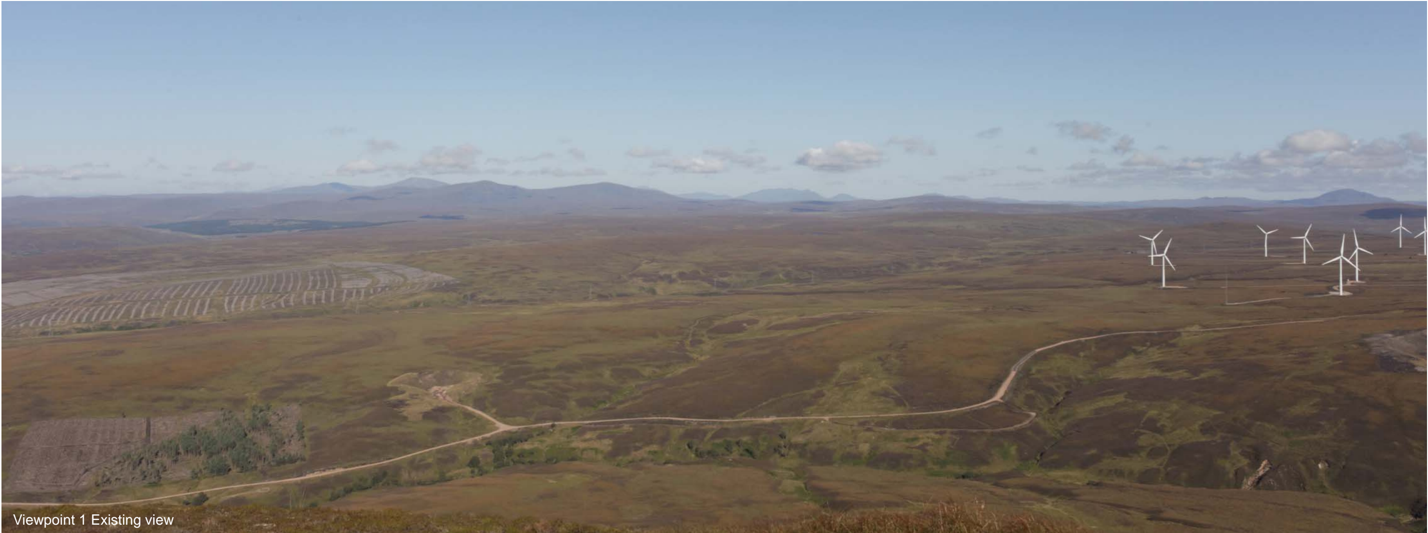
Viewpoint 1 Existing view