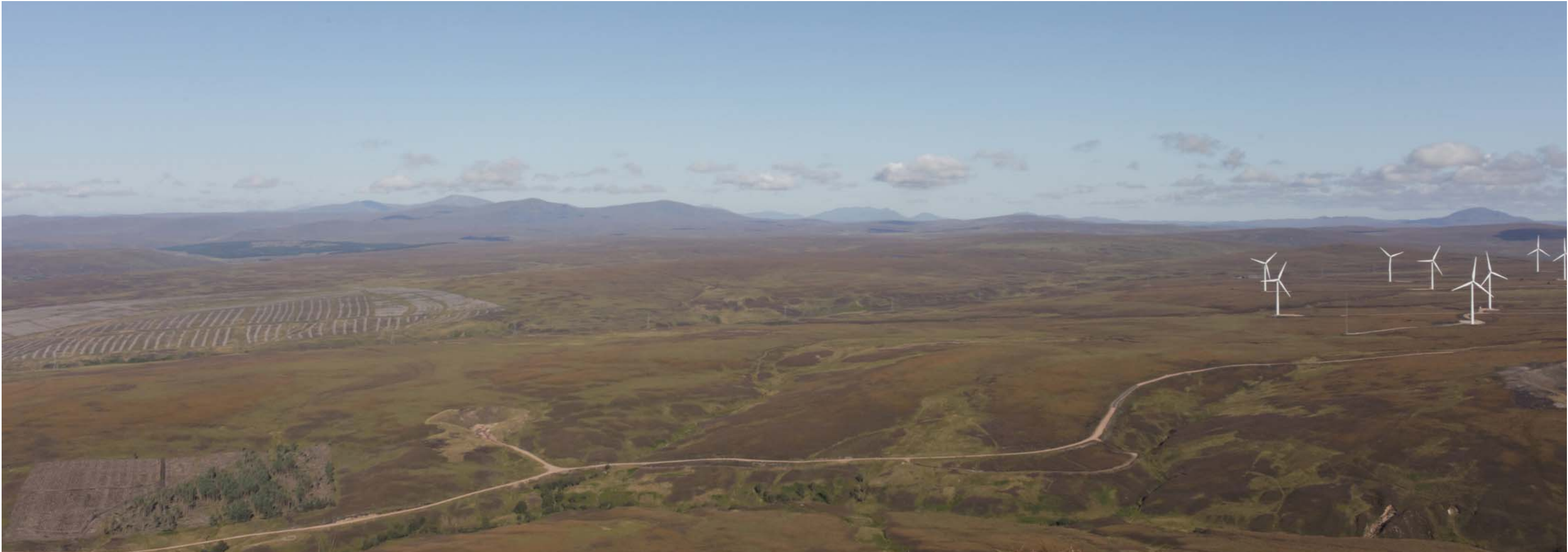
Viewpoint 1 Existing view