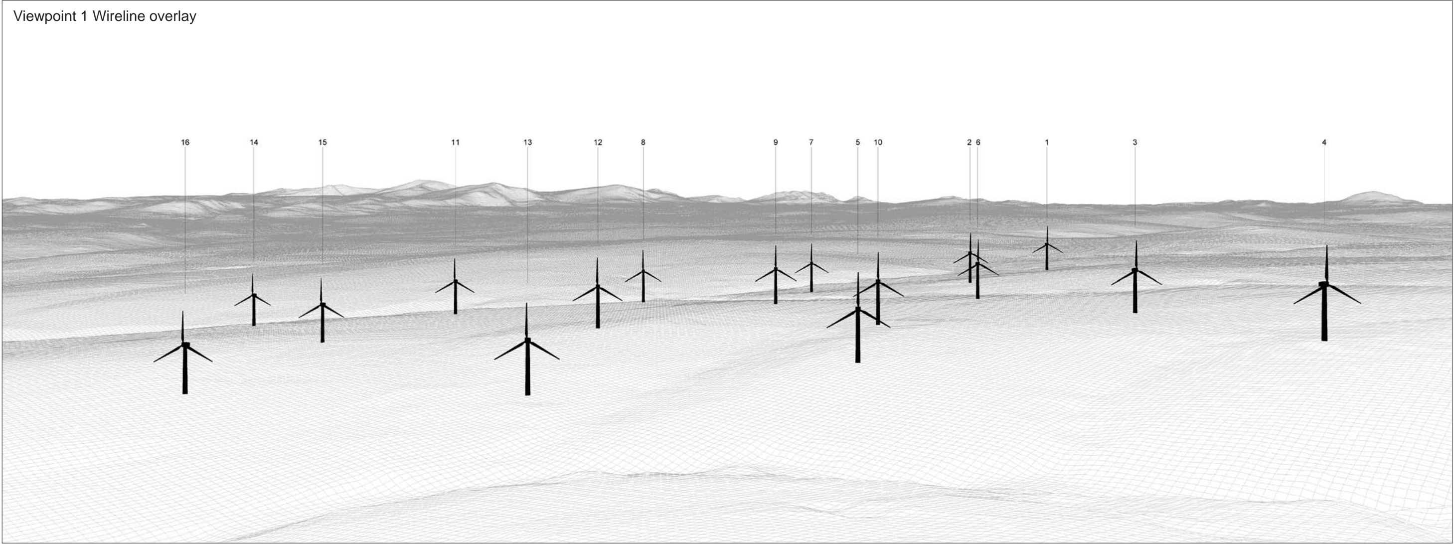
Viewpoint 1 Wireline overlay