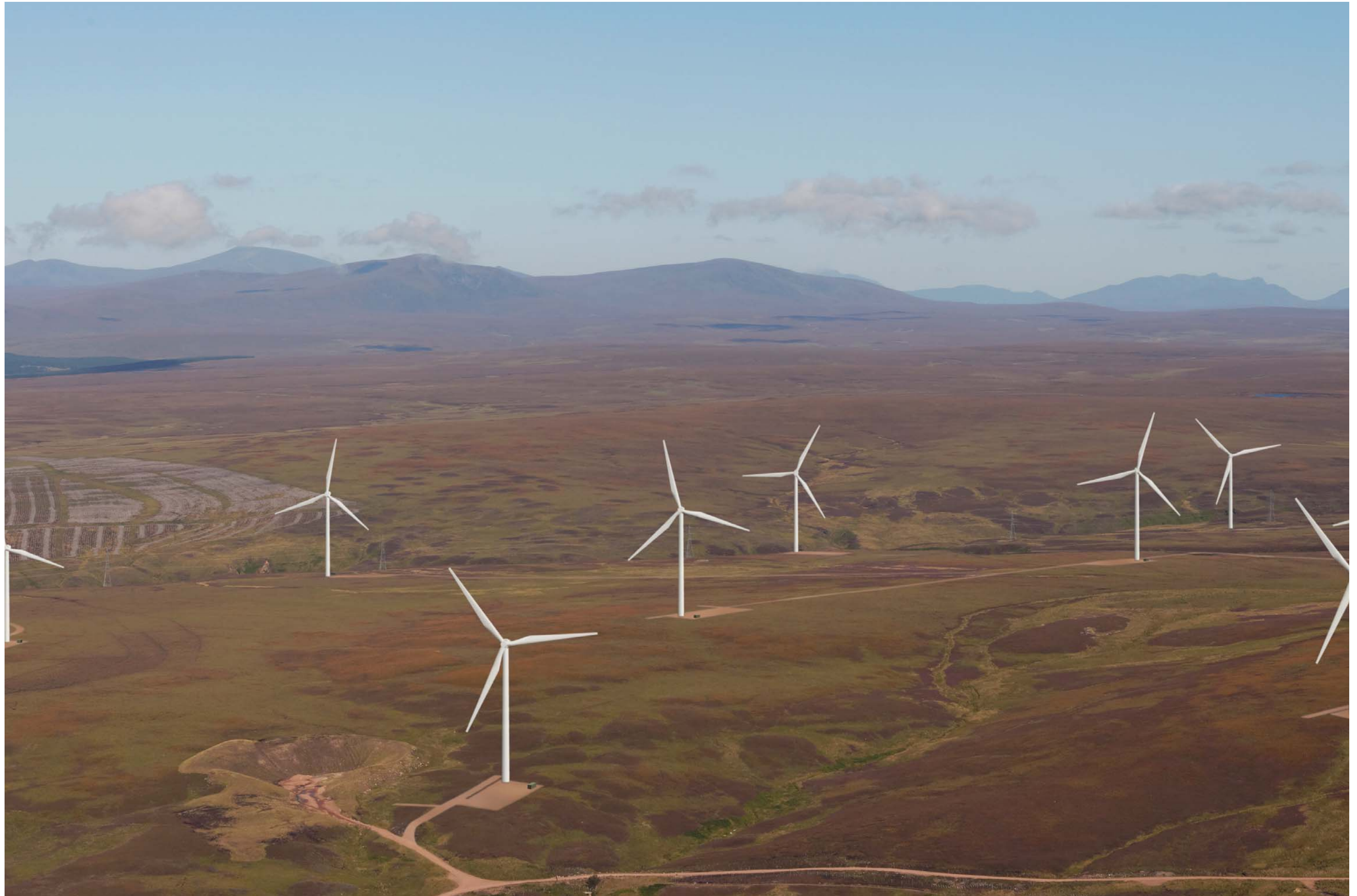
Viewpoint 1: Beinn Smeorail