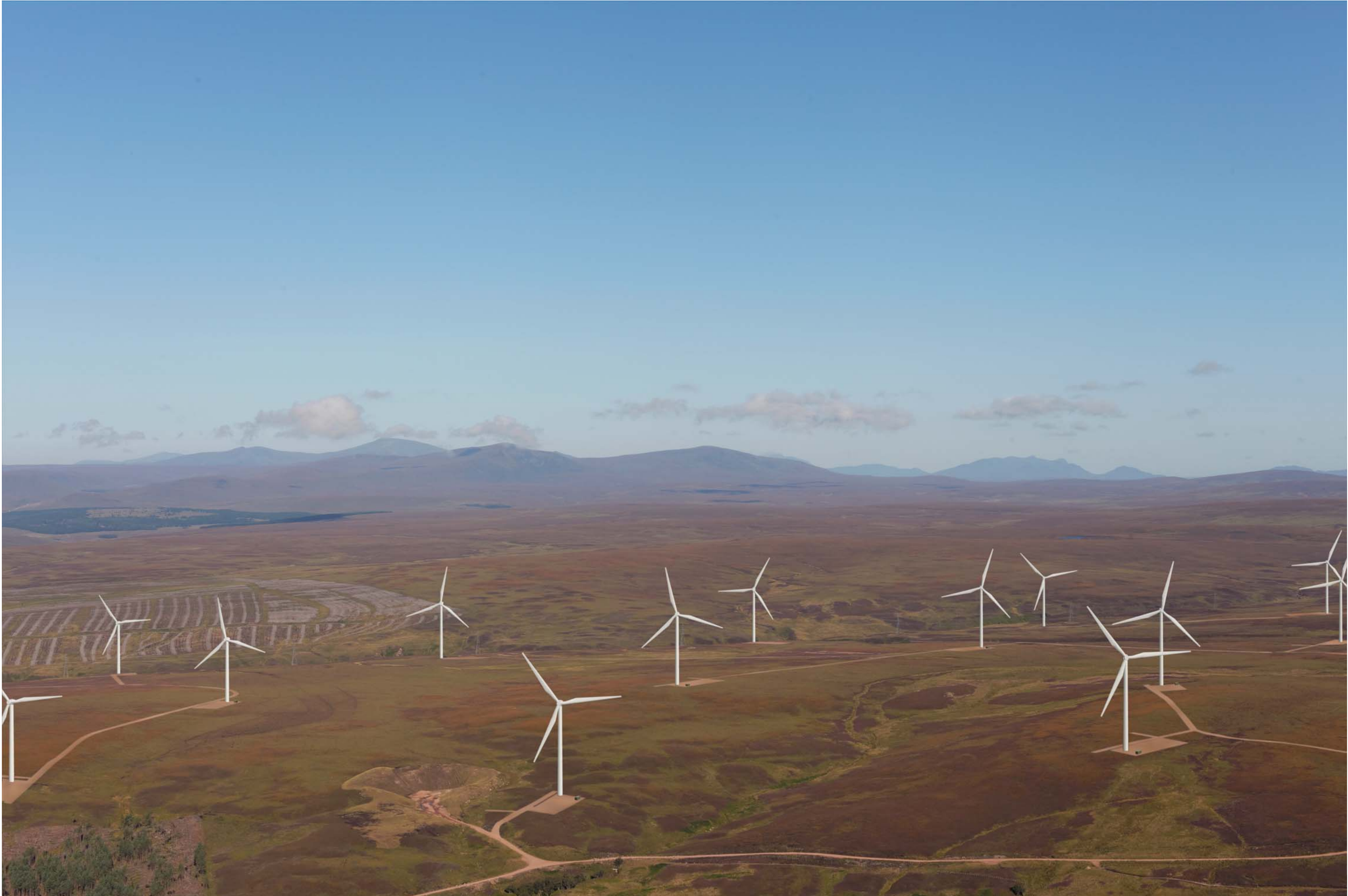
Viewpoint 1: Beinn Smeorail Distance to nearest turbine: 1.602km Camera: EOS 5D II Focal length: 50mm Camera height: 1.5m Date: 27/08/14 Time: 08:39 When viewed at a comfortable arm's length, this image is representative of the maximum field of view of clear vision but is not representative of scale and distance.