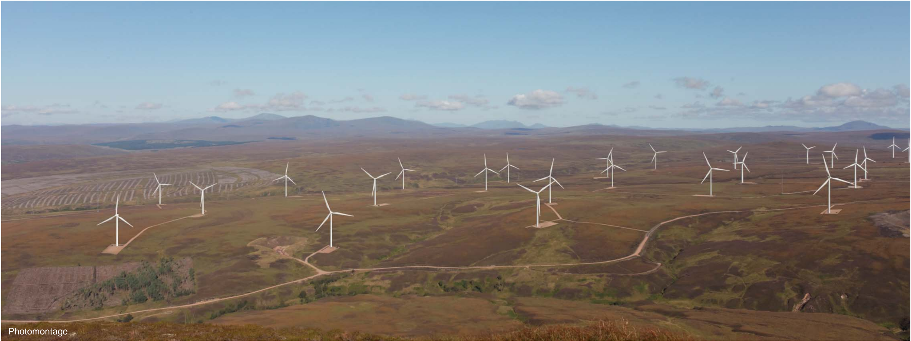
Viewpoint 1: Beinn Smeorail

Distance to nearest turbine: 1.602km Camera: EOS 5D II Focal length: 50mm vertical (27°) x 28mm horizontal (65.5°) Camera height: 1.5m Date: 27/08/14 Time: 09:00